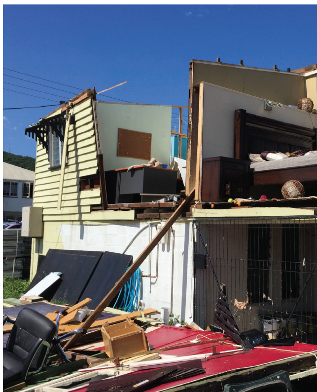
Engineering solutions to help buildings, particularly older buildings, cope during high winds are not widely implemented.

However, post-event damage assessments conducted over the last 15 years by the Cyclone Testing Station ( www.cyclonetestingstation.com ) show that engineering solutions to wind vulnerability, particularly for older homes, are not being widely implemented (Boughton & Falck 2007, Boughton et al. 2011, Henderson et al. 2006). This is due in large part to the absence of community engagement activities with respect to engineering solutions for risk mitigation. For example, the 'Get Ready Queensland' program is an important community outreach program that emphasises general disaster preparedness education (i.e. trimming trees, emergency kits, and evacuation plans) but does not identify engineering deficiencies and facilitate associated solutions, which typically drive severe losses during cyclones.