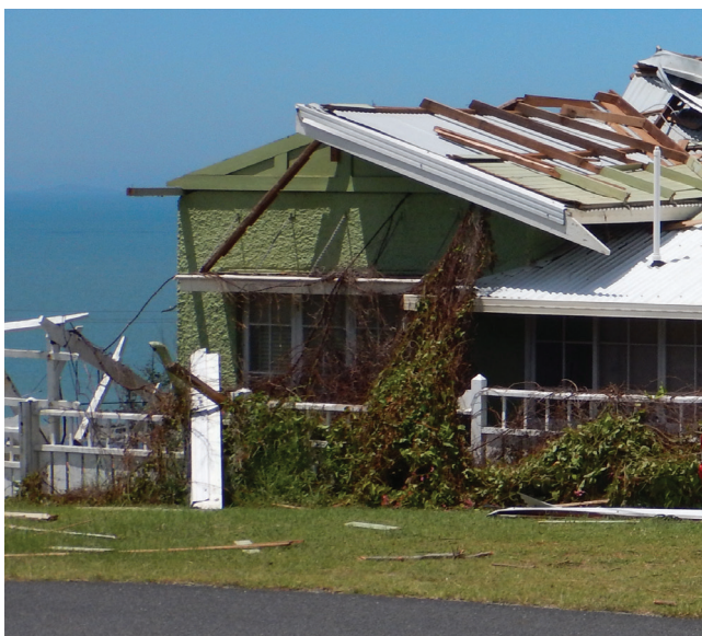
Severe roofing failure due to weak roof framing connections in properties happened during Cyclone Marcia in 2015 in Yeppoon, Queensland.

Safe Florida Home' program found that only 40 per cent of respondents indicated that reduced insurance premiums were a key motivator in undertaking improvements to their home (Sink 2008). Financial incentives of this nature are more likely to be effective if used in concert with other behavioural drivers.