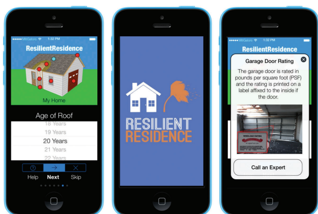
Screen captures of current wire-frame U.S. version of ResilientResidence™ including building attribute selection (left) and attribute help screens (right).