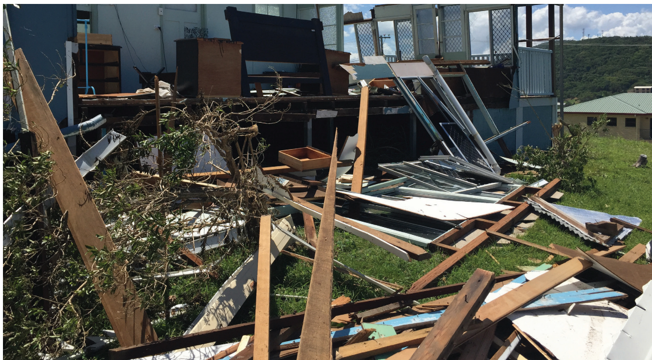
Cyclone Marcia caused significant damage to property in Yeppoon, Queensland due to its severe winds and the way properties were constructed. Image: Cyclone Testing Station, James Cook University.

communities by reducing structural vulnerability and enhancing the economic well-being of the region.