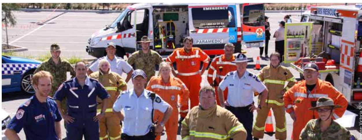
Volunteer organisations contribute significantly to community capacity in emergency management.