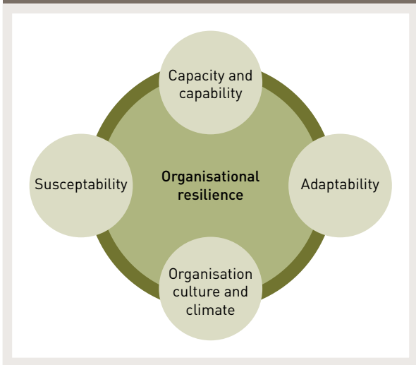
Figure 1: Underlying dimensions of organisational resilience.

The less well known concept of organisational climate, however, stresses more patently measurable perceptions of staff regarding issues such as stress, morale, work/life balance and employee engagement – i.e. the shared perceptions of policies and practices among employees (McMurray 2003). Organisational climate contrasts with organisational culture as it is