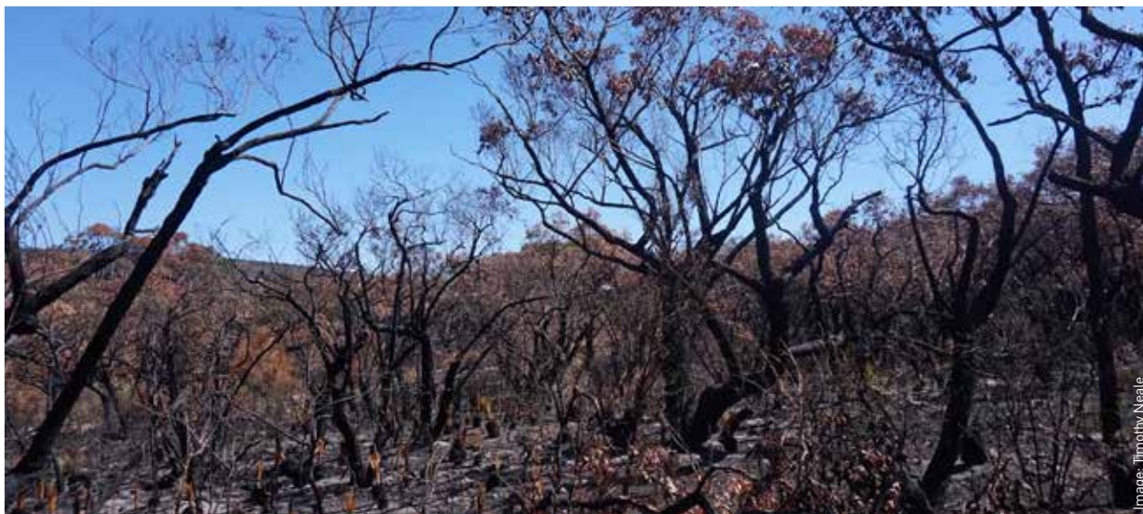
An area recently treated with prescribed burning at Moggs Creek, Surf Coast, Victoria.

uncertainties. 'The ecological stuff is, of course, a minefield of uncertainty,' for example, due to deficits in understandings of surrogacy between species. Several practitioners indicated that 'all [measures] are laden with assumptions and errors and biases,' but testing and constructing such data was a necessary part of progress requiring significant ongoing effort and investment. Assets and values other than human life must be countable to 'count' in such contexts. As one practitioner concluded, 'The key will be to be able to get [all] metrics right so that people can make informed decisions around what we're doing'.