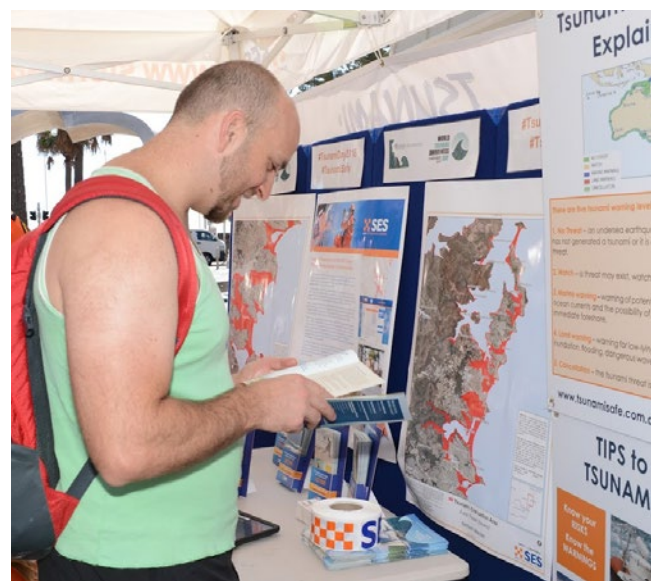
Using local maps should be part of community-based planning for a tsunami.