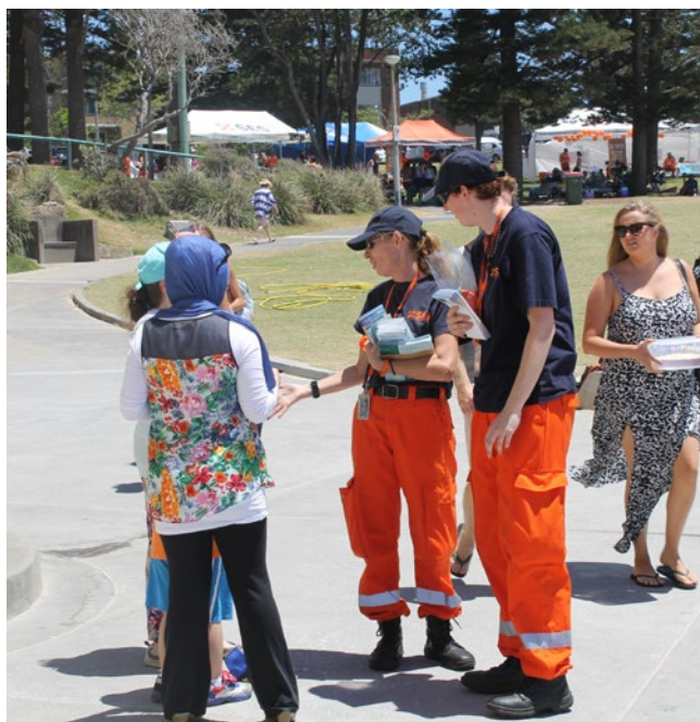
NSW SES personnel speaking with people about the tsunami risk in their local area.