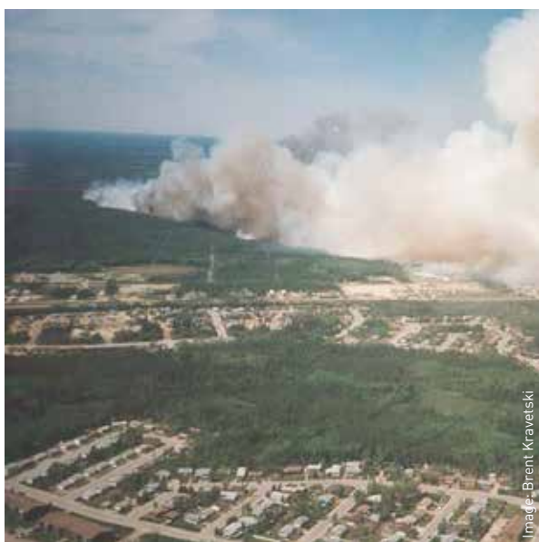
The Mallard Fire threatened the lakeside resort.

'You look at people that have health problems, and they were holding their own for a while and then they went downhill. We lost quite a few after the fire. Since that time there have been major health issues in the community and the rates of cancer have been high. I'm not sure if our community has blown up because of the fire or what, but it is horrendous the amount of people who are getting cancer.'