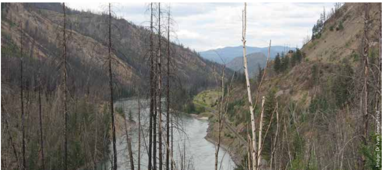
Landscape around Barriere from the wildfire impact.

There were individuals in both communities who had ongoing difficulties with the fires, even though they may not have experienced being evacuated, or may not have lost their home or possessions.