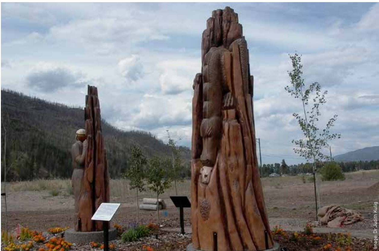
The Barriere monument for the fire is a 'fire dragon', carved out of an old-growth cedar tree for the anniversary event in 2008, five years after the fire.