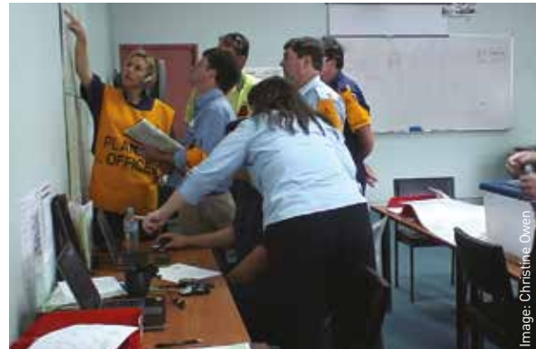
Women and men play an active and co-operative role in incident management teams.

Other researchers contend that women cannot be stereotyped into passive or lower ranked roles since, drawing on Foucault, power is productive and relational rather than simply repressive and hierarchical (Cooper, 1994). In research conducted by Maleta (2009), the gendered and cultural experiences of Australian female firefighting volunteers were examined. She concluded that women experienced both inclusion, in terms of camaraderie, fellowship and community participation, and exclusion in terms of leadership and bravery. Her research suggests that by actively participating in a masculinist socio-cultural context, women were not subordinated or marginalised but were simultaneously challenging and recreating cultural norms and perceptions. "The positioning of women within a male culture is not straightforward and it is presumptuous to assume female oppression or subordination when traditional roles and identities are undergoing transformation" (Maleta, 2009, p296).