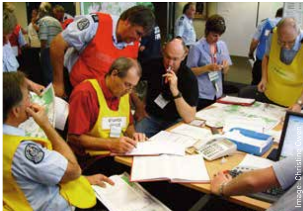
Incident management teams must pool their ideas to meet the challengers of emergency situations.