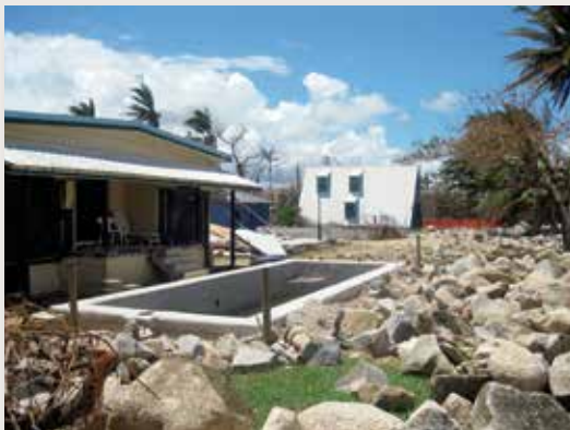
Damaged beachfront rock wall