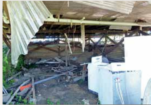
Field tests allowed participants to test the tools and make assessments