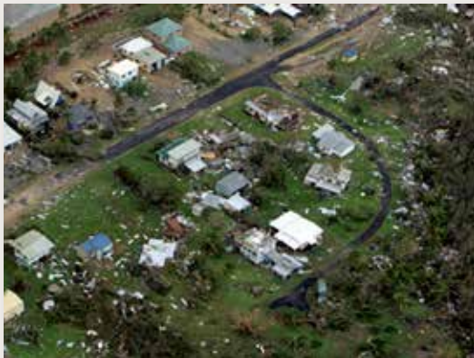
Asbestos containing material littered private, public and state land

Mass gatherings, such as those at evacuation centres, present some of the most complex management challenges faced by governments. The influx of large numbers of people and the infrastructure needed can place a severe strain on public health systems and services. This may compromise the ability to detect developing problems and make effective responses (World Health Organization, 2009).