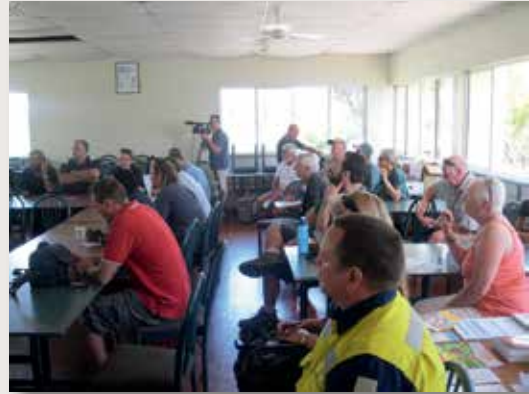
Pre-exercise briefing to participants