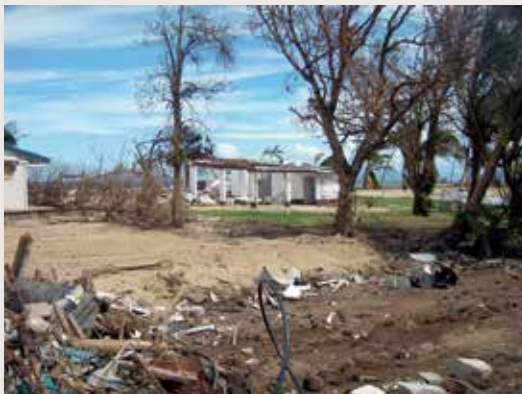
Tidal surge destroyed some houses