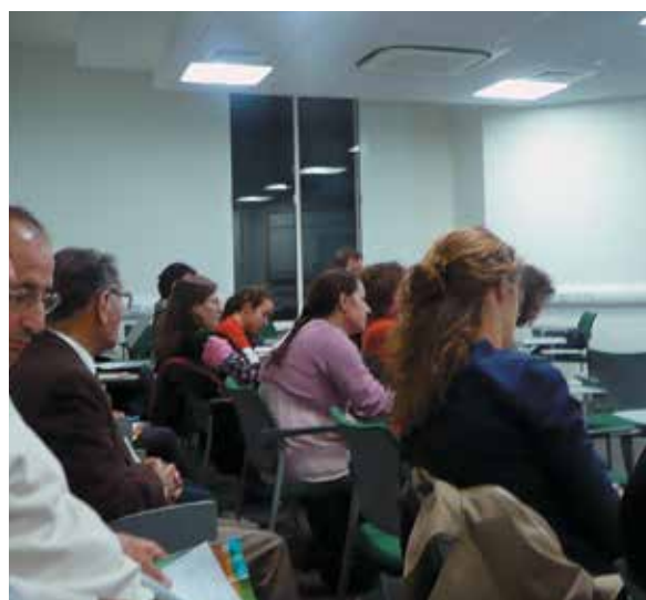
Narrative interviews were used to explore complexities and processes and focus groups were used to validate findings.

For the purpose of this research a narrative approach was considered most appropriate, as this would provide access to the salient views, values and reality of living in seasonally threatened bushfire community. Further to this, the study used two different techniques in order to obtain a rich and full understanding of the experience of living in a bushfire community. Narrative interviews were used in order to understand the complexities and processes that emphasised the community members' experience (Mishler, 1991), and a focus group was used to validate the findings that emerged from the interviews with regard to what factors are important in living in a seasonally threatened community.