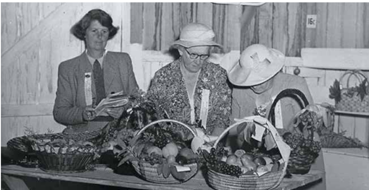
Women have very important roles in our community and are key players in community mobilization in pre and post-disaster activities.

The themes that emerged suggest that it is a combination of factors that are relevant to a disaster experience at the individual level and the community level. The factors identified (self-efficacy, coping style, social networks, sense of community and community competence) presented a more comprehensive picture of the possible variables that may mediate the disaster experience. It is therefore the interplay of these factors that are important to the experience of a community facing a natural seasonal disaster. Further to this is the relationship between, and the combination of, community competence and sense of community. Kulig (2000) refers to the combination of these variables as community resilience (see Pooley, Cohen & O'Connor, 2006). Therefore one of the conclusions from this study results is that by increasing the competence of the community and the attachment residents have for the community you may be targeting and effecting community resilience.