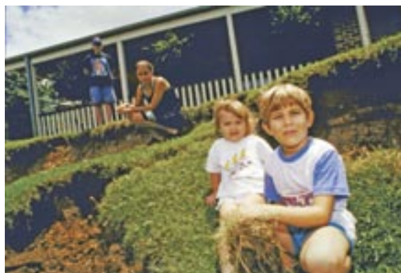
Having good foundations to your house and ensuring that the house is secured to its foundations can minimise the risk to a house

Earthquake Anxiety (2) acts to reduce the likelihood that people will begin the preparedness process. That is, it