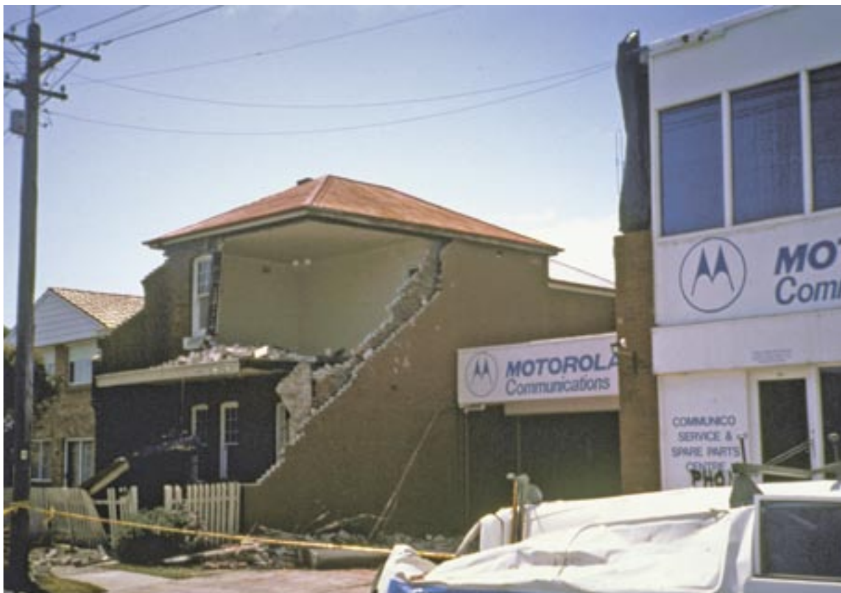
While the house at the centre of the photograph has been damaged, those around it have remained relatively intact. Differences in quality of construction or maintenance can help explain the uneven distribution of damage. This highlights the importance of including building checks and regular maintenance in an earthquake preparedness plan and rectifying any problems to minimise damage

In the phase two analysis (figure 1, phase 2), the model provided a good fit for the data ( \chi^2 = 8.15 , df = 4 , p=0.12 ) and confirmed the importance of the distinction between 'Intention to Prepare' and 'Intention to Seek Information'. Only 'Intention to Prepare' predicted earthquake preparedness. In contrast, 'Intention to Seek Information' represented an end point, and did not, either directly or indirectly, predict preparedness.