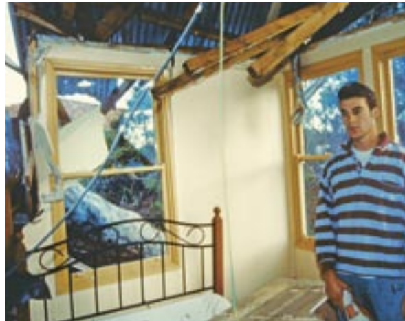
The risk of damage to a house and injury to its inhabitants can be minimised by securing the roof and internal fixtures such as high bookcases and mirrors

Current approaches to promoting preparedness assume it exists on a scale from low to high levels, and that any intervention will result in a movement towards greater preparedness. The present study casts doubt on these assumptions. Firstly, it is important to acknowledge that some people may be inhibited from engaging in the process in the first place. In this study, earthquake anxiety (2) was implicated in this regard. Secondly, the existence of two discrete processes that hold different relationships with preparedness suggests that one set of strategies is required to facilitate