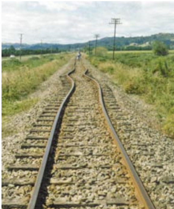
Travel disruptions and freight transport can be disrupted by rail lines buckled by earthquake