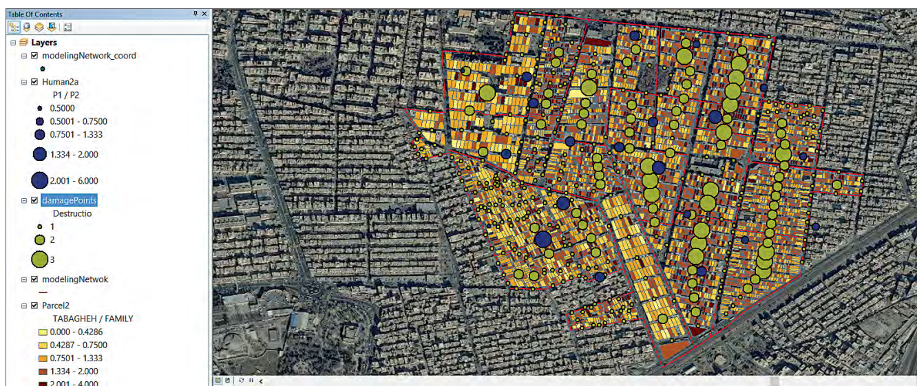
Figure 2: Input data illustrated in GIS to use in the DMCsim for District 17 of the city of Tehran, Iran simulation.

The DMCsim result and evaluation for this case study experimentation demonstrates that if, for instance, an earthquake of level 1 intensity or damage level hit the study area and available responders were deployed to