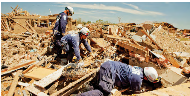
FEMA urban search and rescue team at Moore, Oklahoma, 22 May 2013.

This paper outlines existing preparedness systems and disaster management coordination tools and the unique advantages of the DMCsim system. The methodologies and technologies used for developing the DMCsim system are described. A case-study scenario for an earthquake response operation in a neighbourhood in Tehran city shows the potential for improving the community-based emergency response.