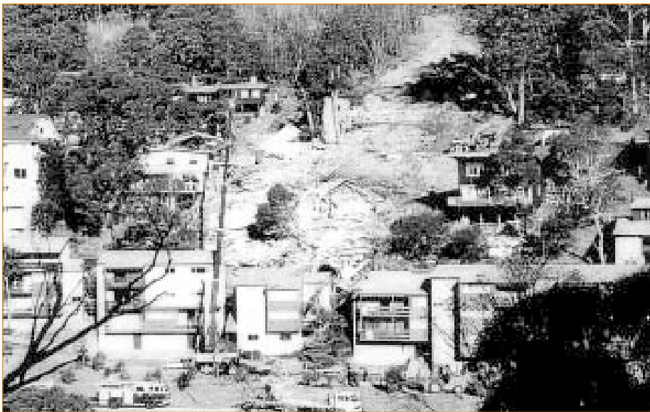
Figure 1: Top – Threbo Village disaster domain before the 30 July 1997 landslide, looking towards Bimbadeen and Carinya Lodges (arrowed). Below – after the landslide.

without full geophysical assessments and fully engineered designs and constructions were also core contributory factors. The singular catastrophic Threbo event on that traumatic night in July 1997 was ultimately seen as a consequence of a long chain of antecedent events starting when the Snowy Mountains Hydro-Electric Authority (SMHEA) commenced construction operations in 1949. Painstakingly, meticulously, and comprehensively, Coroner Hand and his Office teased out and reconstructed the panoply of intertwining activities, dysfunctional decision-making and individual and organisational resource and capability limitations, that lead to the untimely deaths of 18 people.