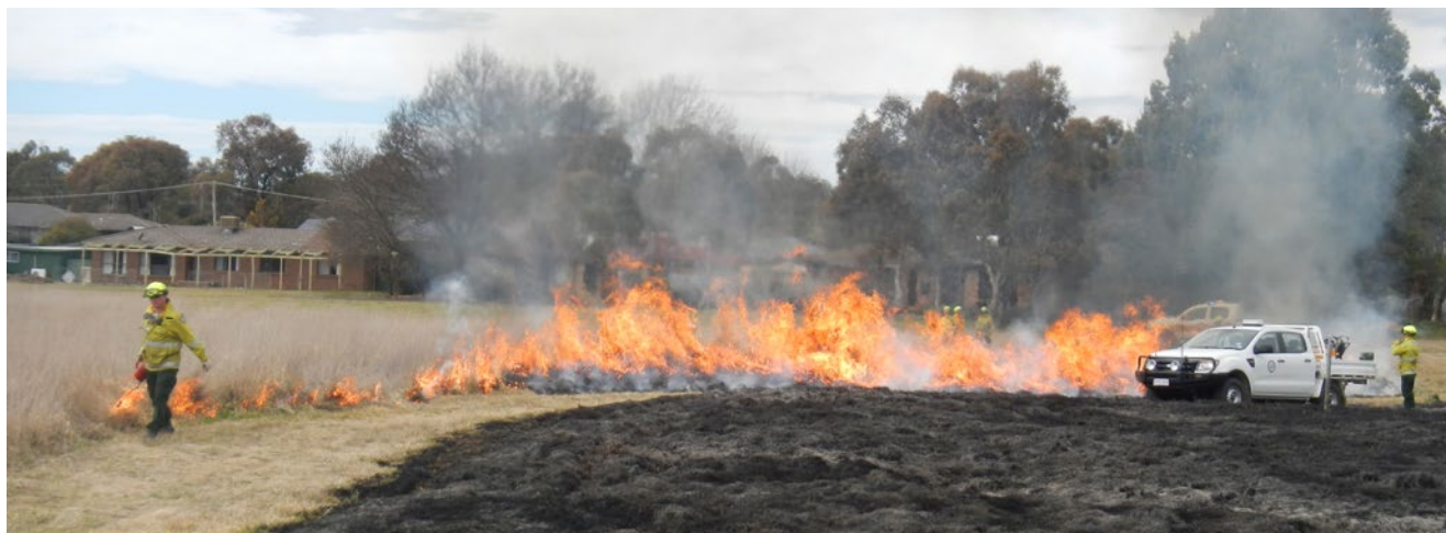
Hazard reduction burning in heavy Phalaris grass at Fraser on the Canberra urban-rural interface in August 2012.

The extra seasonal fire crews brought the physical fuel removal program even further ahead. The burning program got further behind and the fire management unit budget was further underspent. Another big storm in March 2012 caused even more severe damage to the rural road network than the one the previous summer. On the plus side, the grass research project showed that burning in winter, when the fuel loads were at 12t/ha -1 , delivered a fire management benefit the following summer because the treated areas had lower fuel loads and higher fuel moisture than untreated sites (Leavesley et al. 2012).