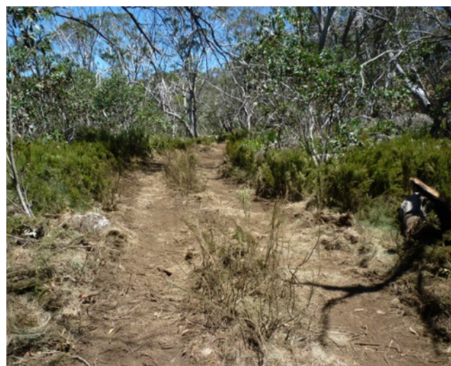
The northern containment line after the fire. The bulldozers were instructed by the Divisional Commander to retain topsoil to aid rehabilitation. The D4 removed the shrub layer while the bigger blade on the D6 was used to remove branches from the Snow Gums ( Eucalyptus pauciflora ).

Mountain and Mount Ginini were proven to have done their job thoroughly and the ACT avoided what could have been a repeat of 2003. The success that day—10 years after devastating 2003 fires—was the key to the whole season. An environmental team assessed the Ginini fire site on 11 January and rehabilitation of the bulldozer trail was completed before the end of the month.