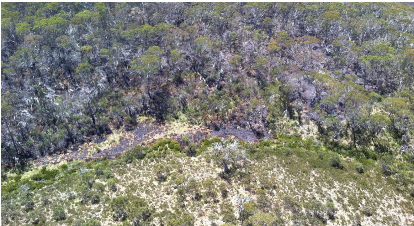
The Ginini fire beat the bulldozer to the Ginini wetland (middle of picture) but was extinguished by helicopters before it could run up the hill (foreground of picture). The control line and vehicle turnaround is faintly visible in the middle of the picture beyond the tree line.