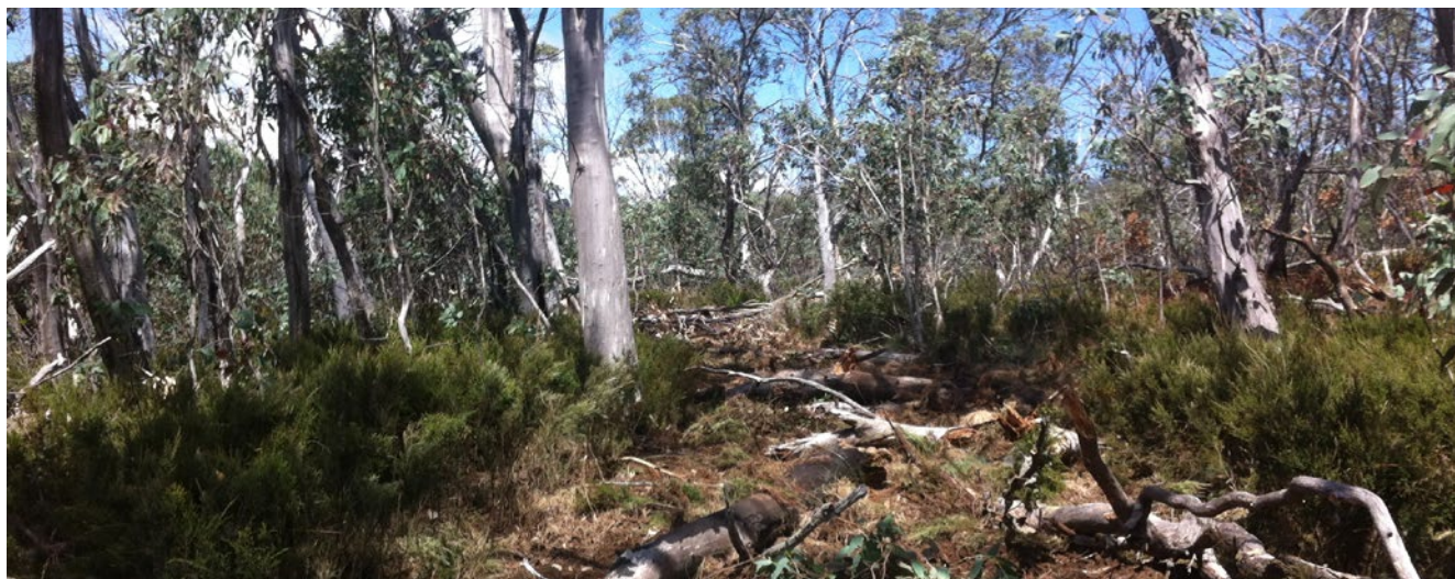
The northern containment line after rehabilitation. Logs, litter and topsoil were scattered over the containment line by an excavator supported by a fire management crew. If the fire had broken containment, staff would have been committed to suppression and rehabilitation would have been delayed.