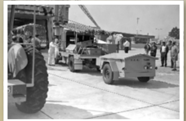
A truck and trailer sent by the Sydney City Council arrived on the Empress of Australia less than a week after the fires.