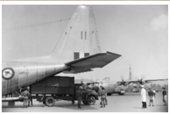
Air Force Hercules freighters ferried tonnes of equipment into Hobart, including emergency electricity generators, mattresses, pillows and firefighting gear.