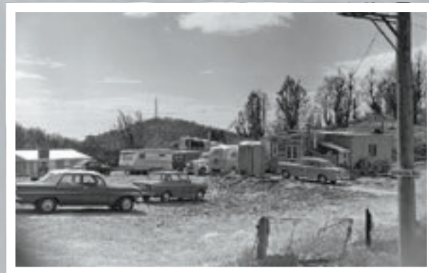
The temporary Fern Tree Store and Post Office where the shopkeeping Street family lived in caravans for a year while keeping their business open.