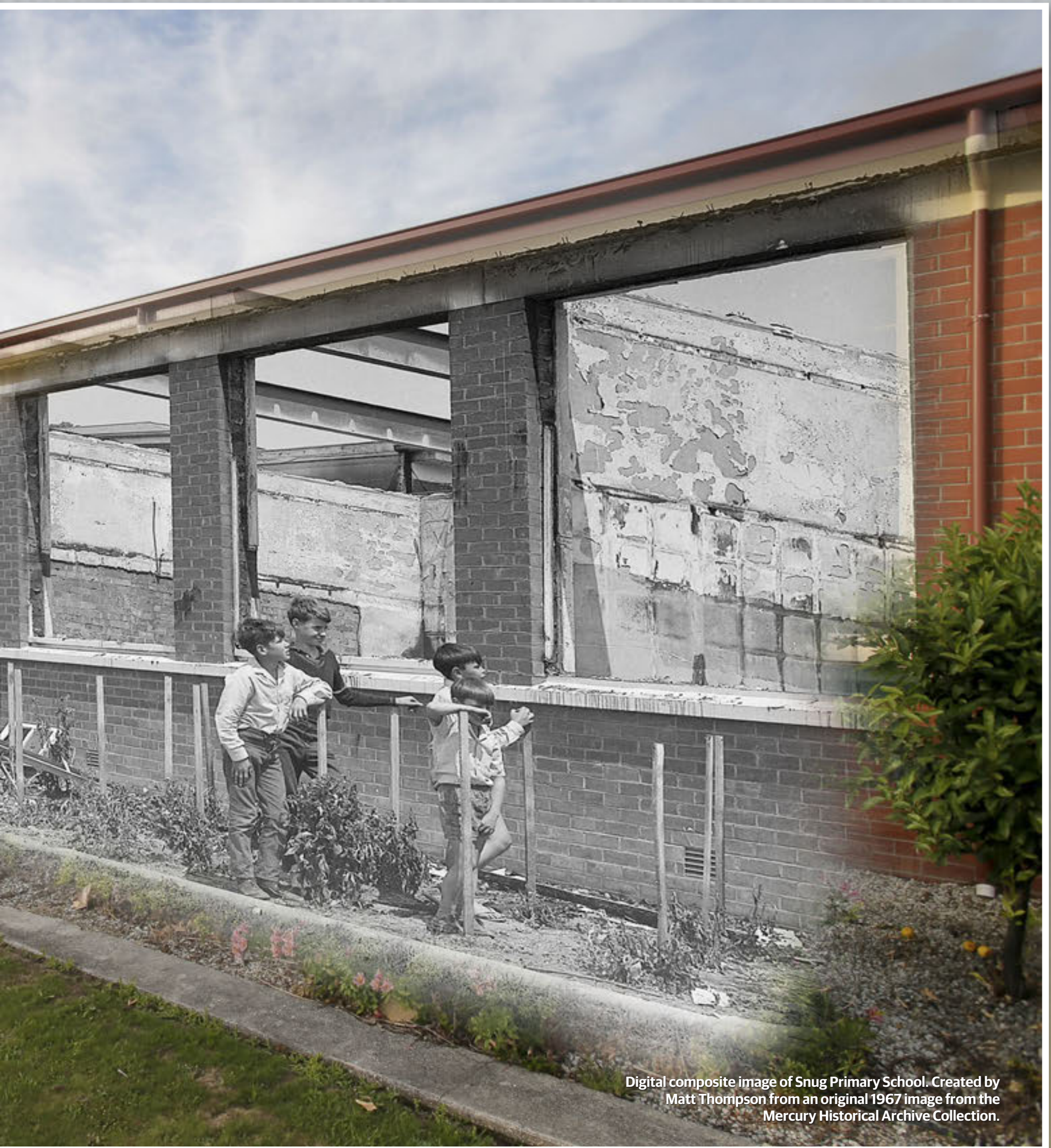
Digital composite image of Snug Primary School. Created by Matt Thompson from an original 1967 image from the Mercury Historical Archive Collection.