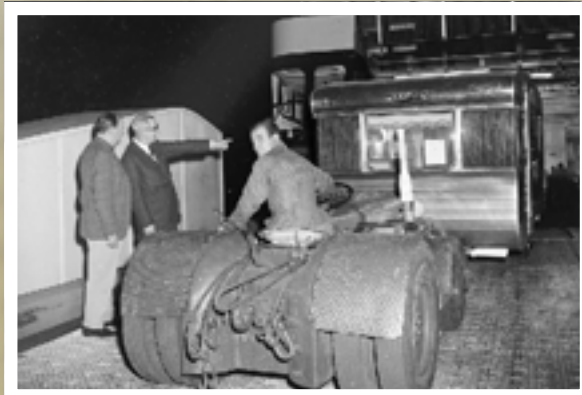
Caravans were shipped to Hobart for emergency accommodation for the homeless. Many were still in use a year later.