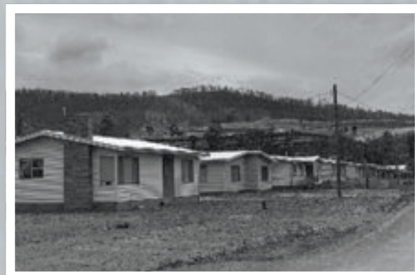
A row of newly-built houses at Snug, which was the worst-hit town on Black Tuesday.