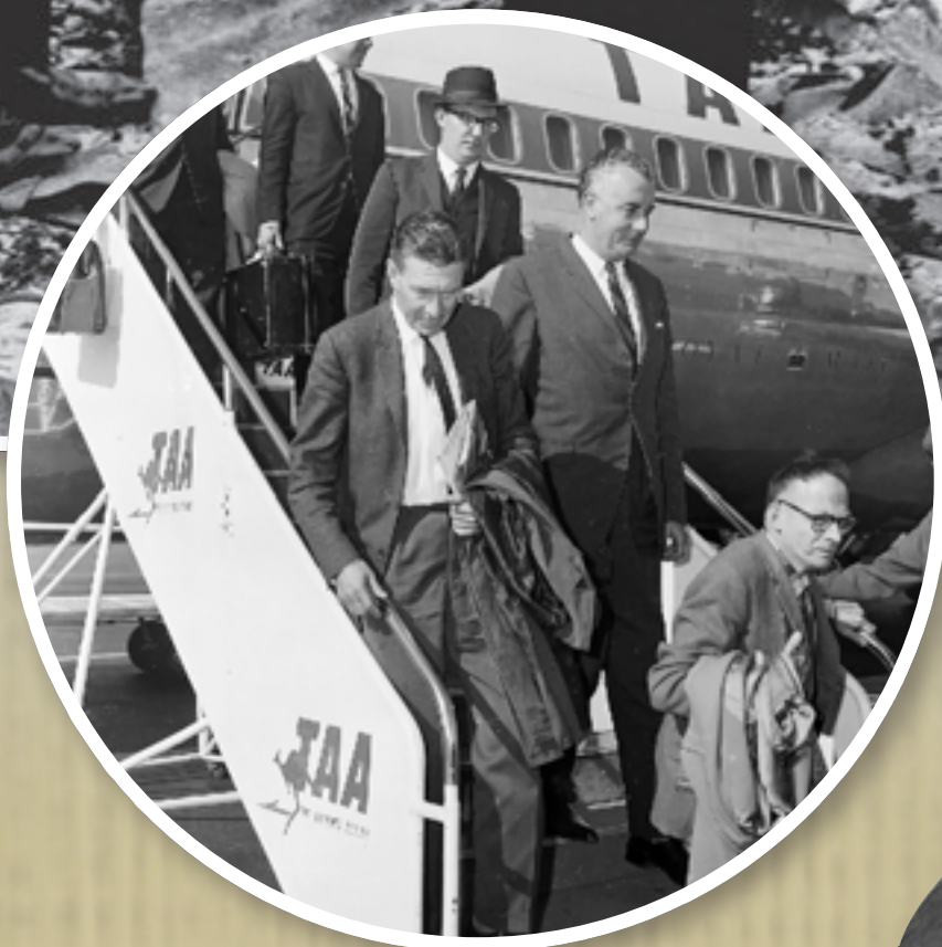
Federal Opposition Leader Gough Whitlam, second from right, flew in to Hobart to inspect the damage and lend support.