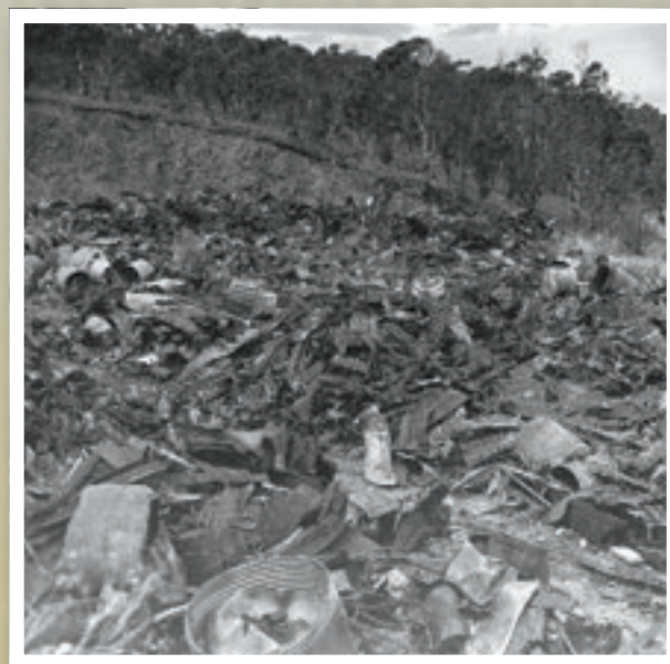
The hundreds of tonnes of rubble from the fires dumped in a quarry near Kettering included water tanks, roofing iron, car bodies, refrigerators and more.