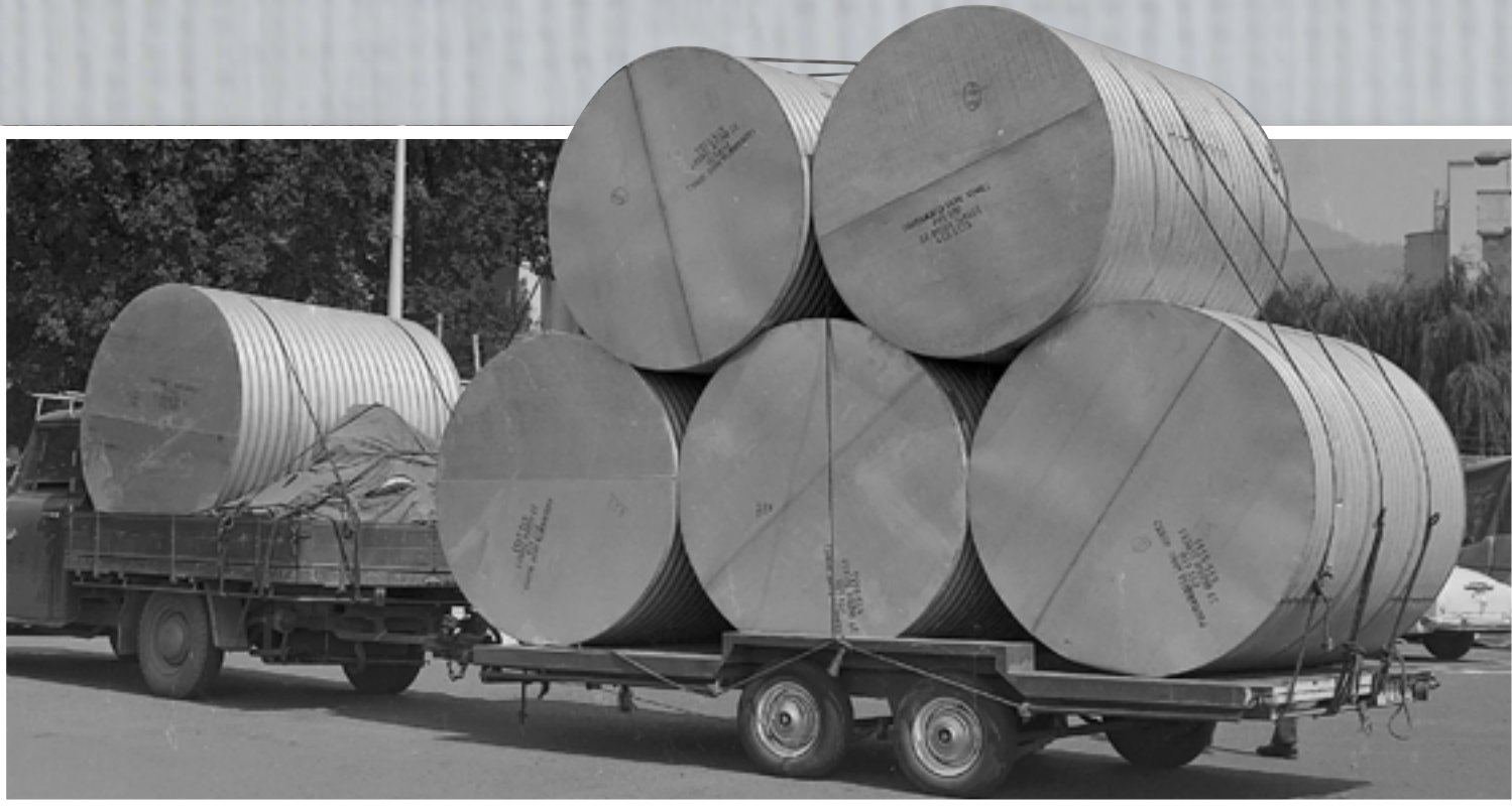
The Parramatta Tank Works donated six 3700-litre water tanks and sent a team of technical officers to aid in reconstruction work.