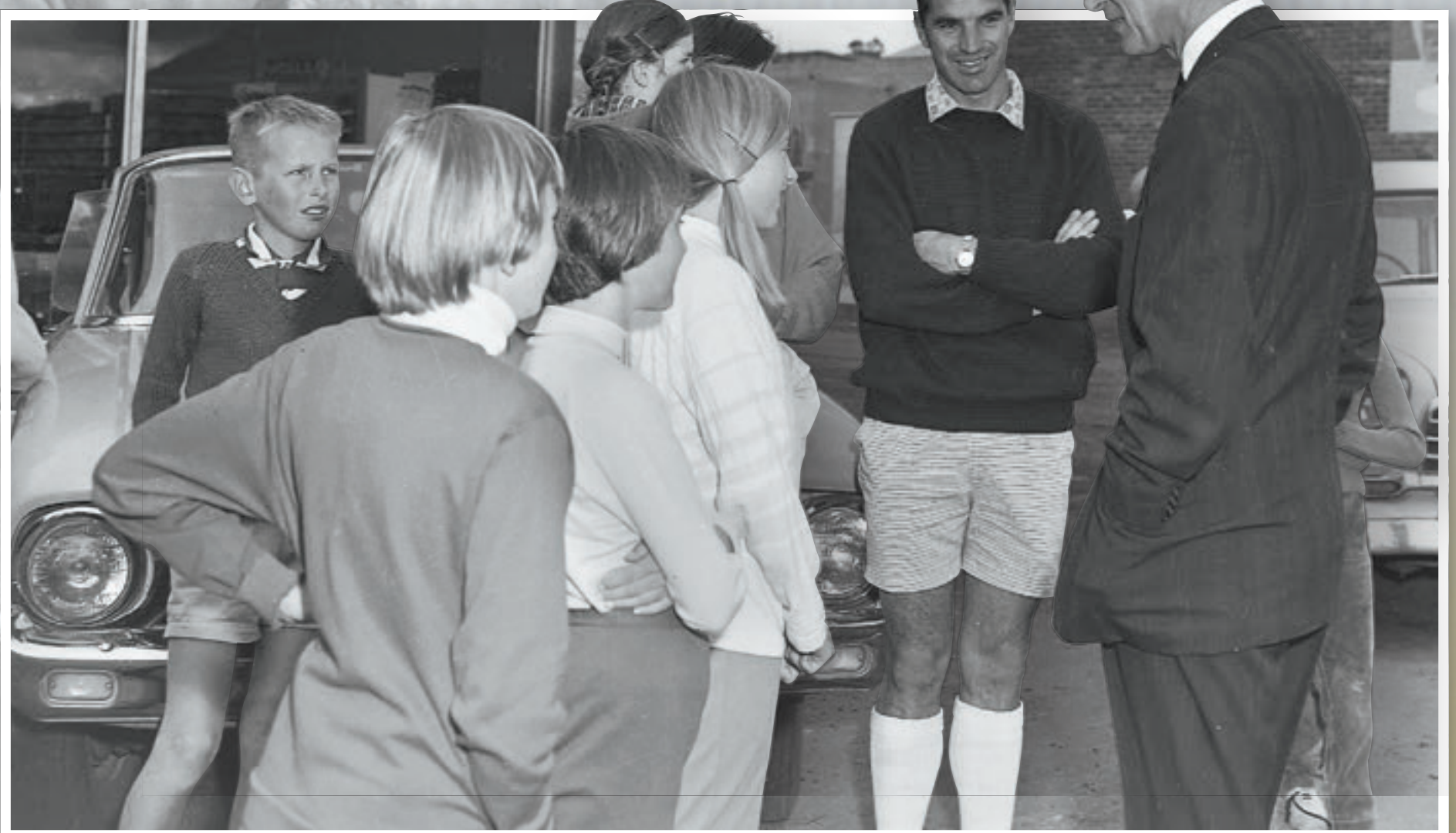
The Prince having a chat with people at the Kingston shopping centre.