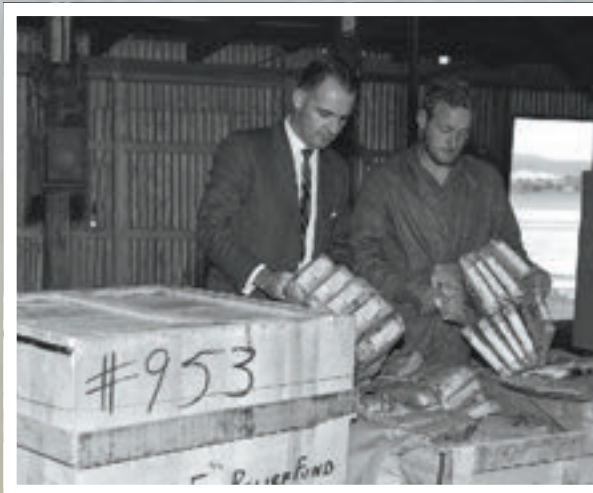
A crate of underwear from Bonds was one of the many donations received soon after the bushfire emergency.

“Reg was more than happy to volunteer,” recalls son