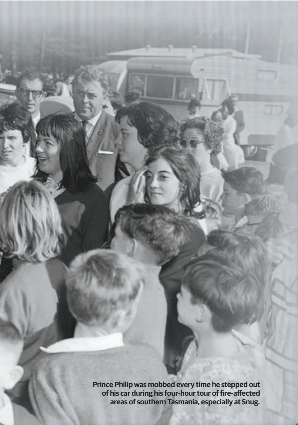
Prince Philip was mobbed every time he stepped out of his car during his four-hour tour of fire-affected areas of southern Tasmania, especially at Snug.