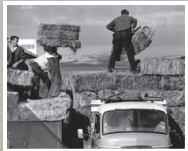
Thousands of bales of hay were transported by rail and road from all parts of the state. Inmates from Risdon Prison helped to load and unload the fodder at Kings Pier.