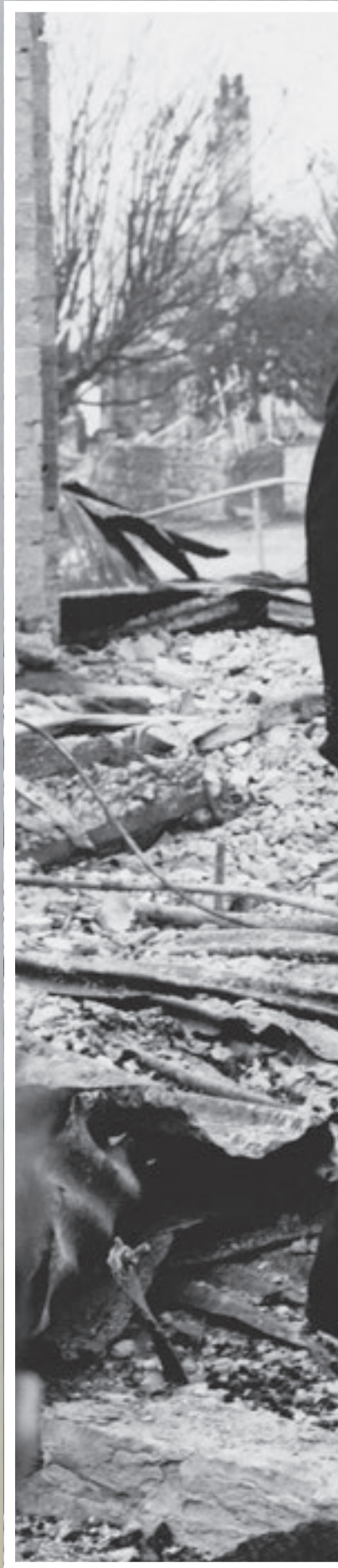
Prime Minister Harold Holt and Tasmanian Premier Eric Reece among the ruins of the Fern Tree Hotel.

Relief supplies of every imaginable kind started rolling in to Hobart within days of the disaster - by land, sea and air. Much of the heavy lifting was done by the Army, Royal Australian Air Force and the Sydney-Hobart vehicular ferry Empress of Australia . Prime Minister Harold Holt arrived within two days to inspect the damage and lend support, followed by Governor-General Lord Casey, newly-elected Federal Opposition Leader Gough Whitlam, and the Duke of Edinburgh.