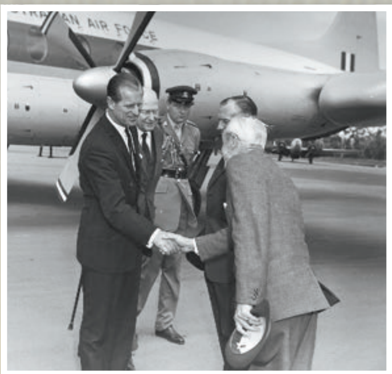
Prince Philip arrived at Hobart Airport aboard an RAAF Vickers Viscount.