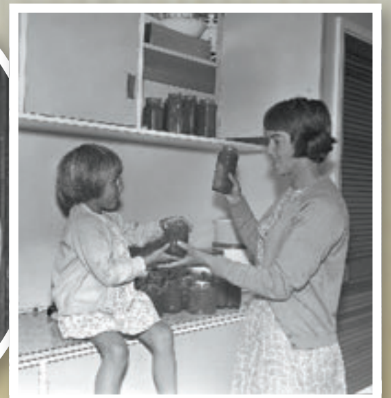
The happy task of stocking the kitchen cupboards in a brand new home 12 months after the fires.