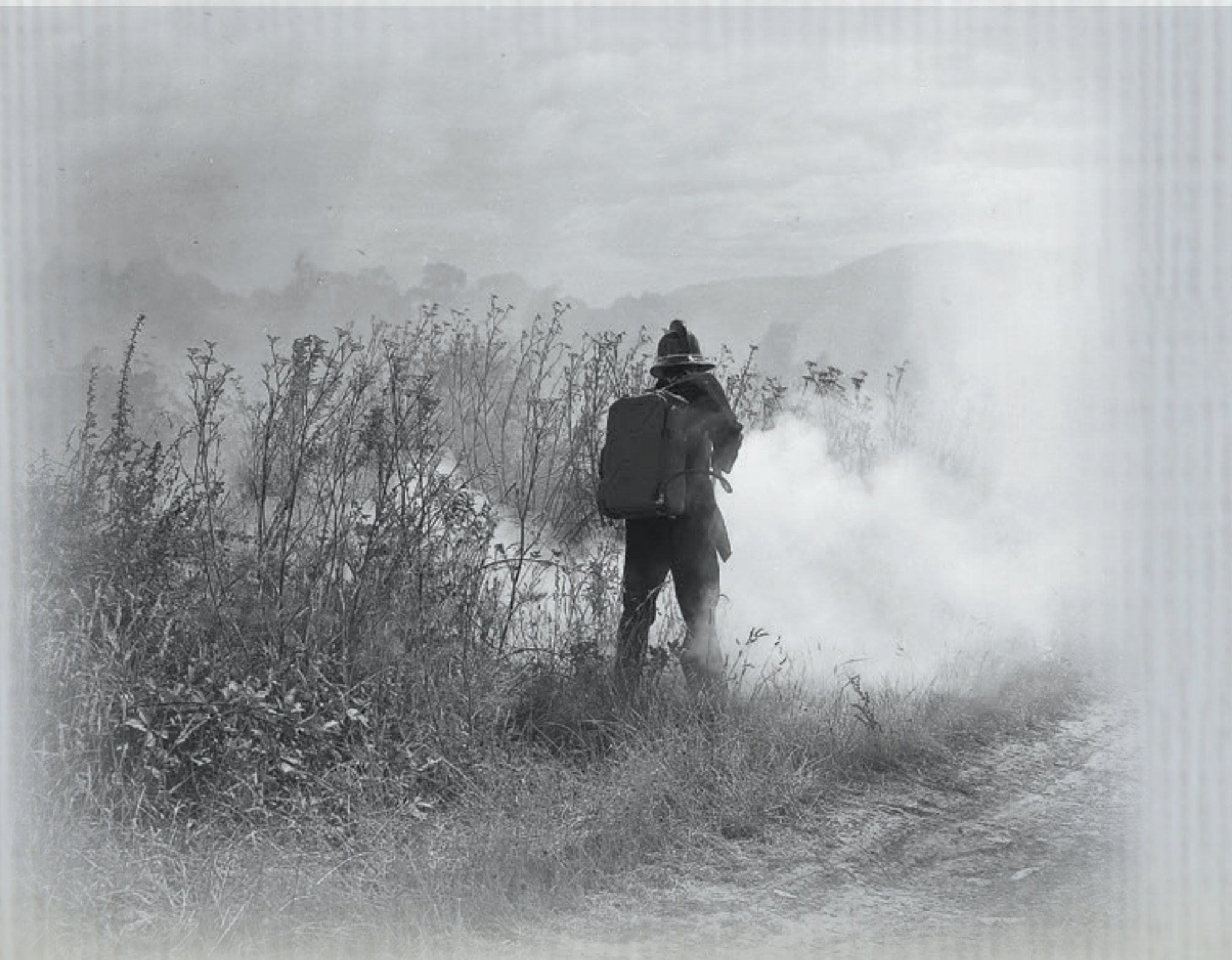
The day before the first anniversary of Black Tuesday, firefighters were tackling a scrub fire at Glenorchy.