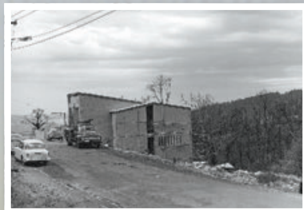
The replacement Fern Tree Fire Station on Summerleas Rd was taking shape in the early weeks of 1968.