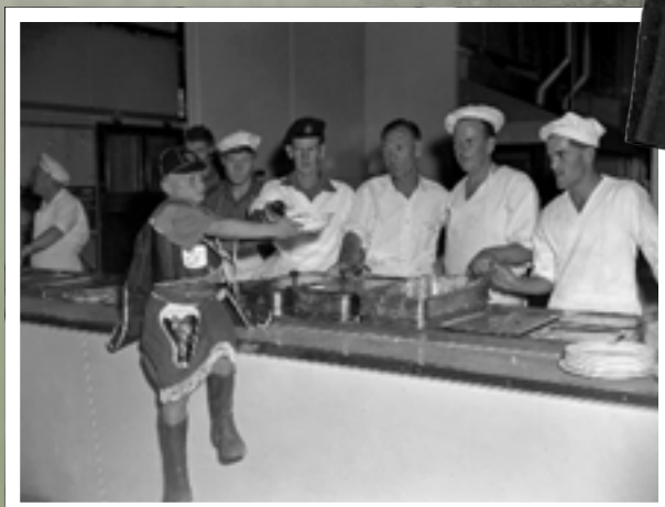
A youngster asks for another helping from the camp cooks.