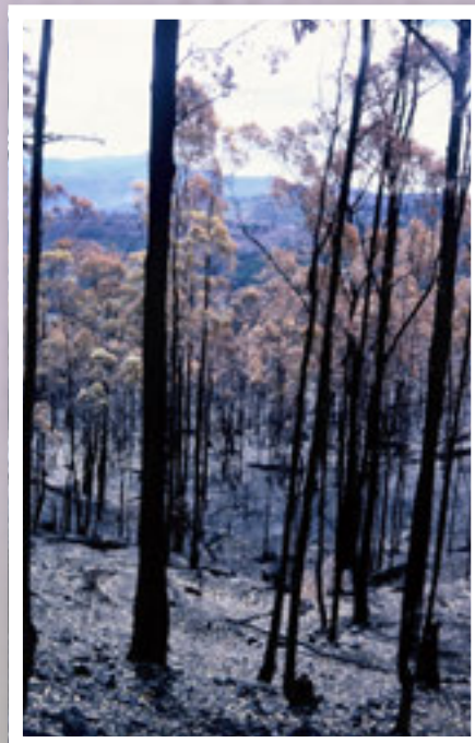
The scene near Lachlan in the Derwent Valley.

There was a house between us and the river a couple of hundred yards away, and that was soon engulfed in flames.