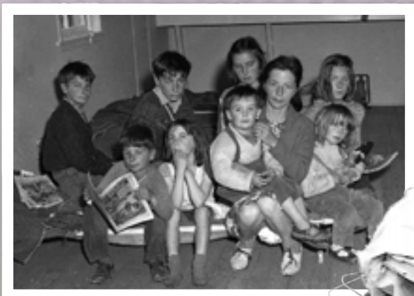
One of the many families that found shelter in the emergency accommodation at the Brighton Army Camp.