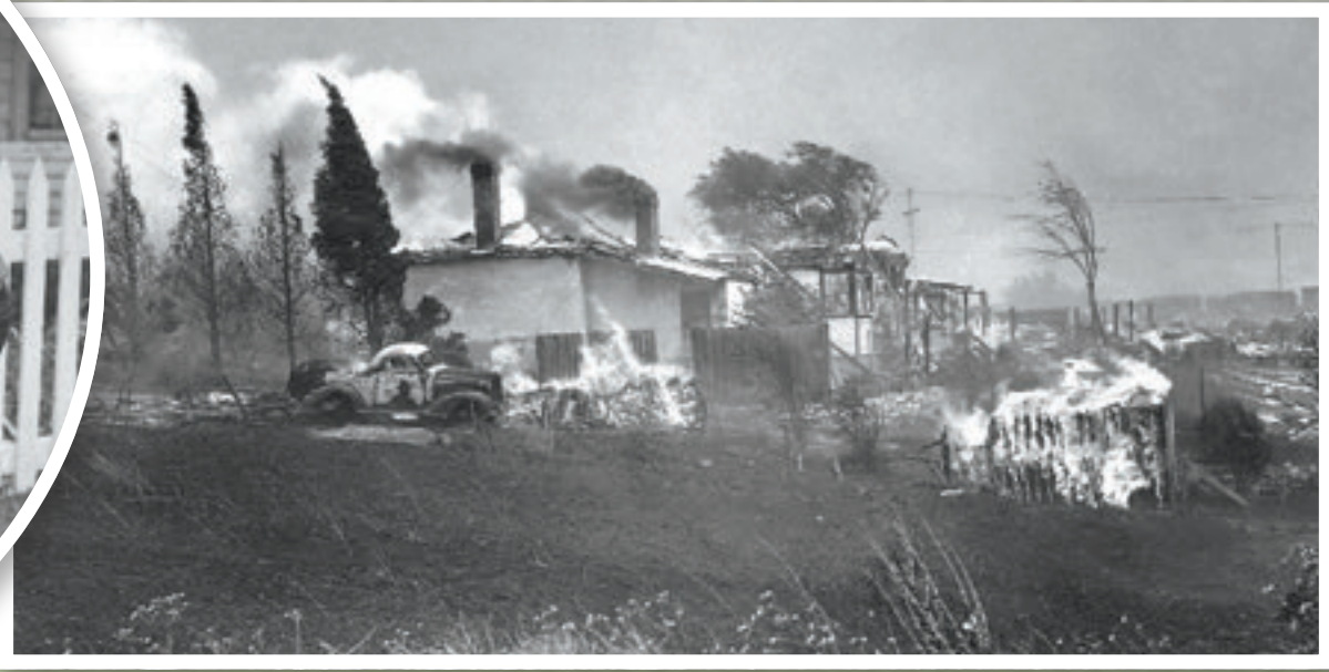
A Bridgewater house and outbuildings fully engulfed by flames.