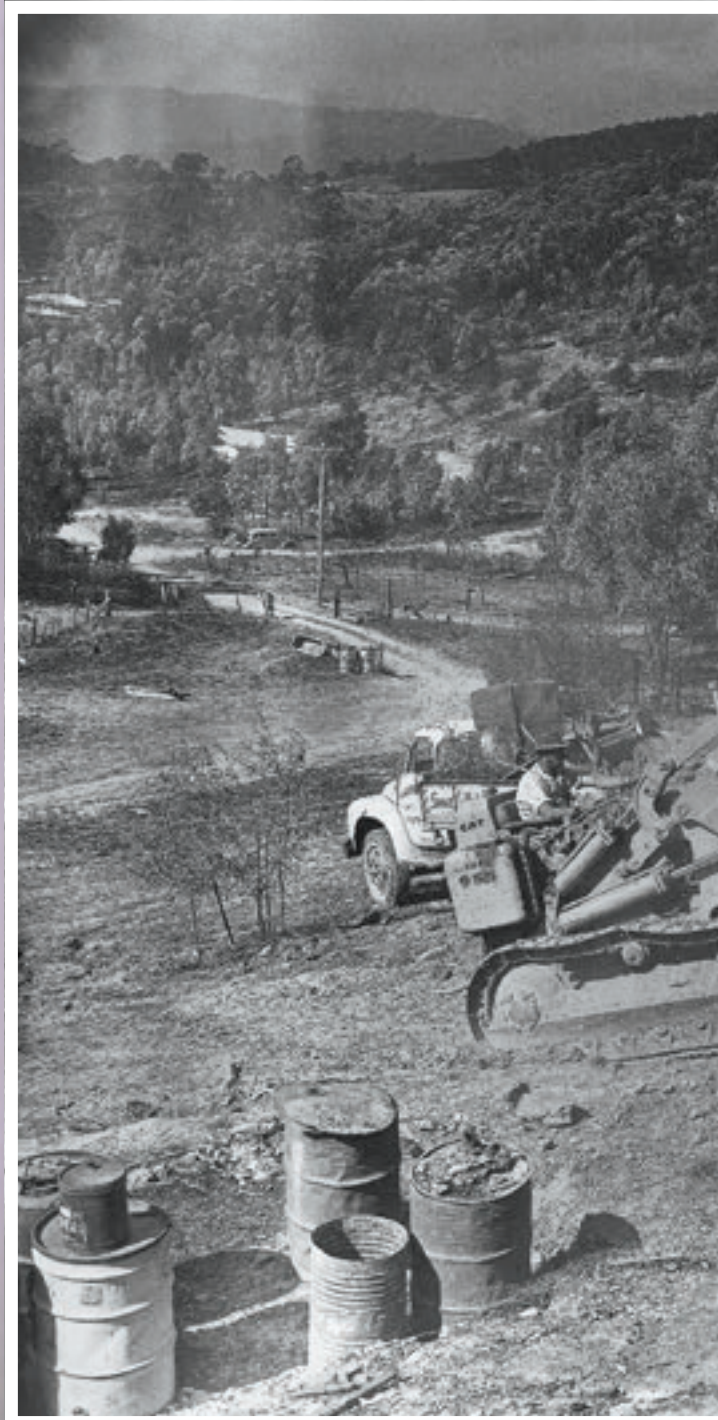
A house and car destroyed in Riverview Parade, Rosetta.