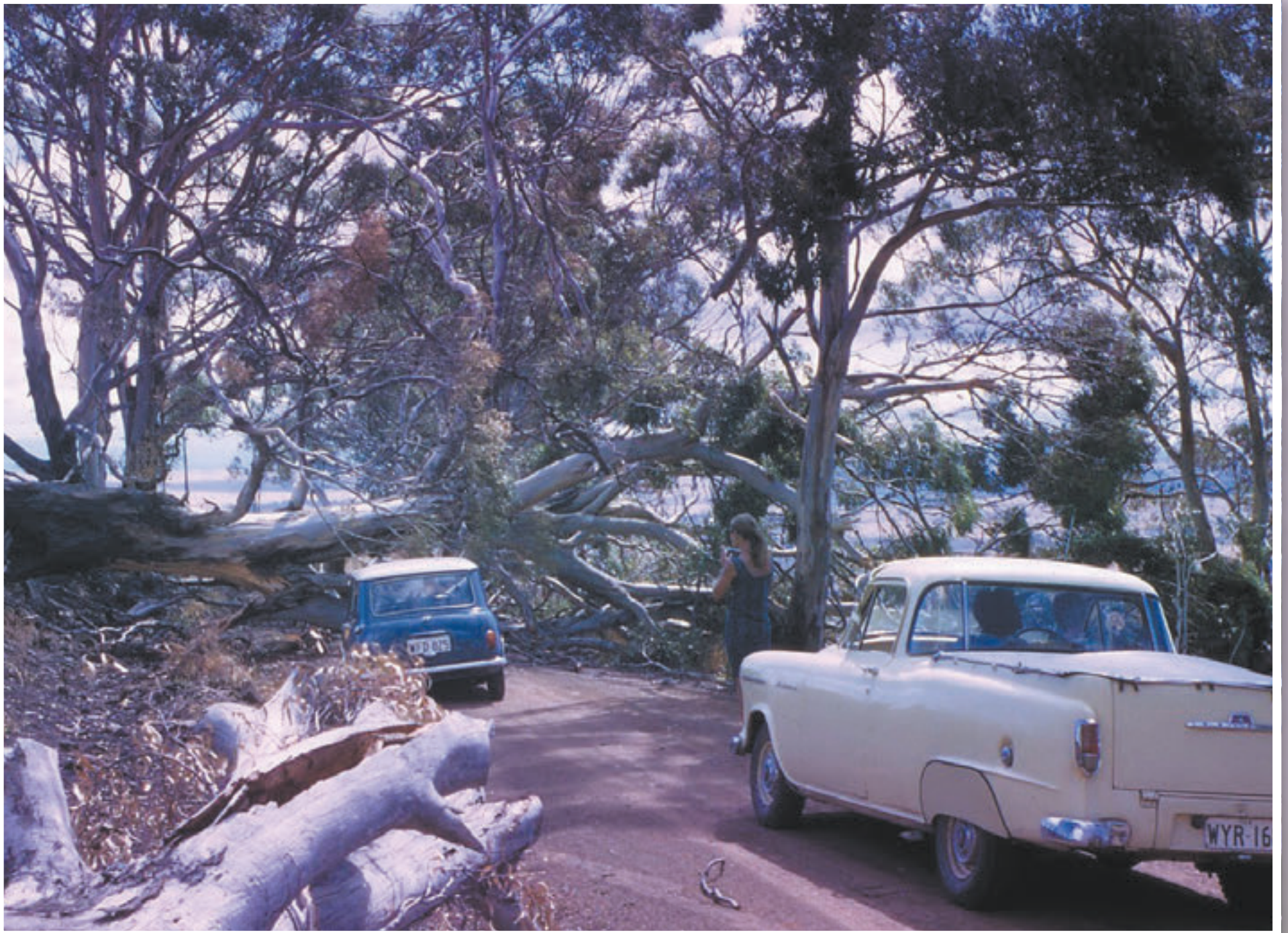
A road near Hamilton blocked by fallen trees.