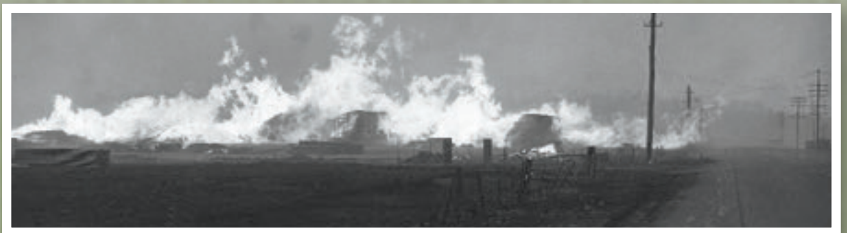
Flames shot high into the air as a stockpile of sawn timber went up in a spectacular blaze at the Rogerville Mill, between Bridgewater and Brighton.