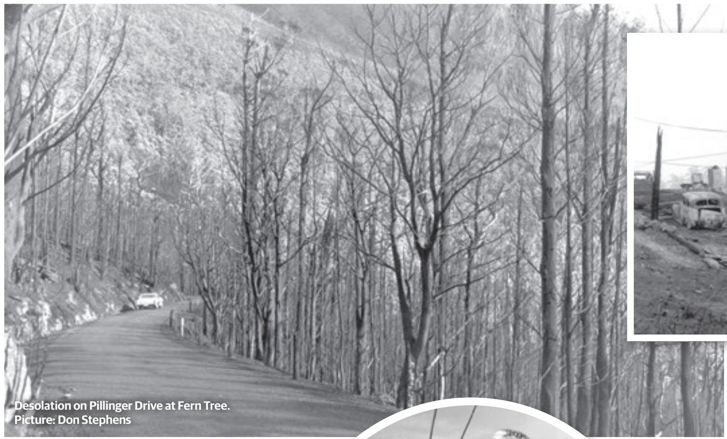
Desolation on Pillinger Drive at Fern Tree.