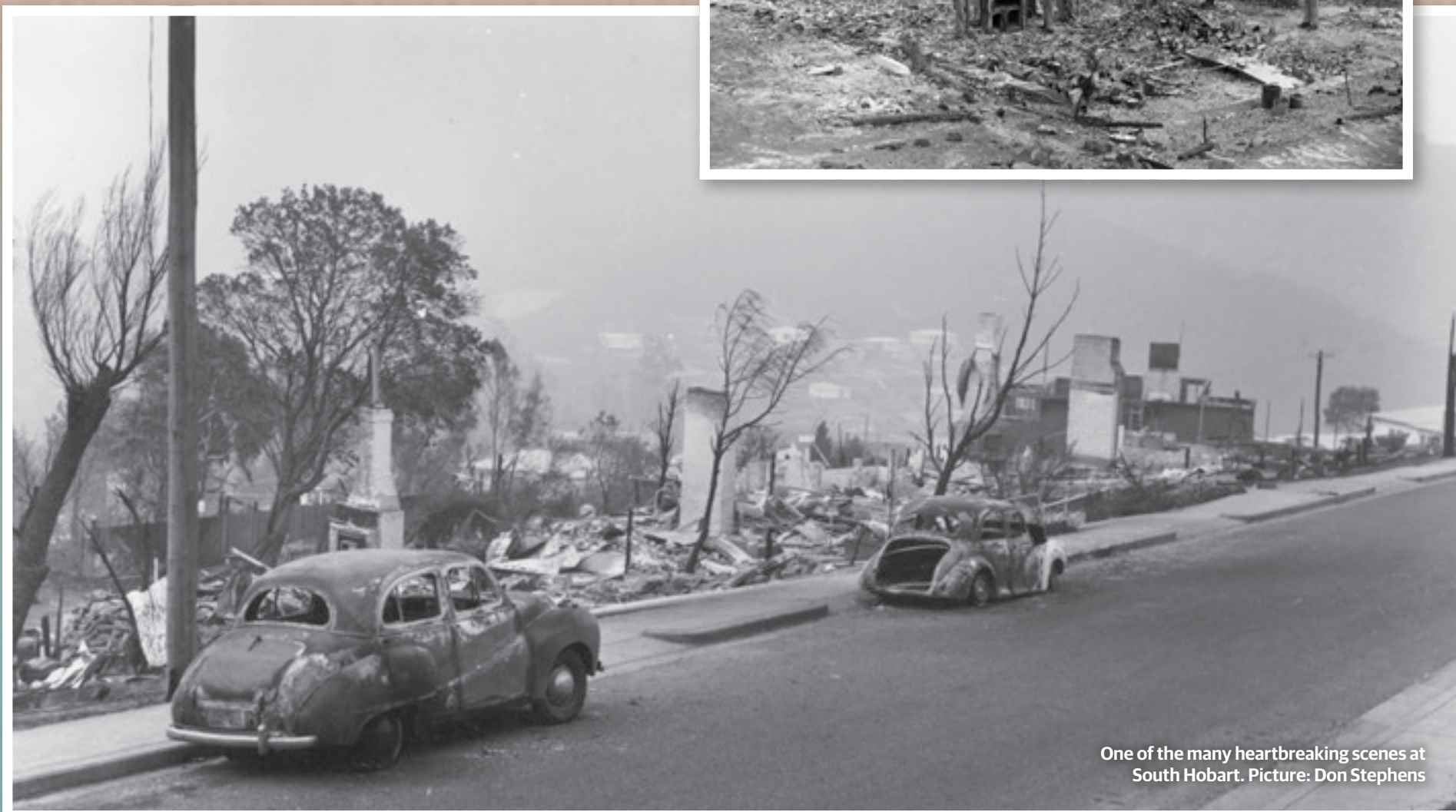
One of the many heartbreaking scenes at South Hobart.