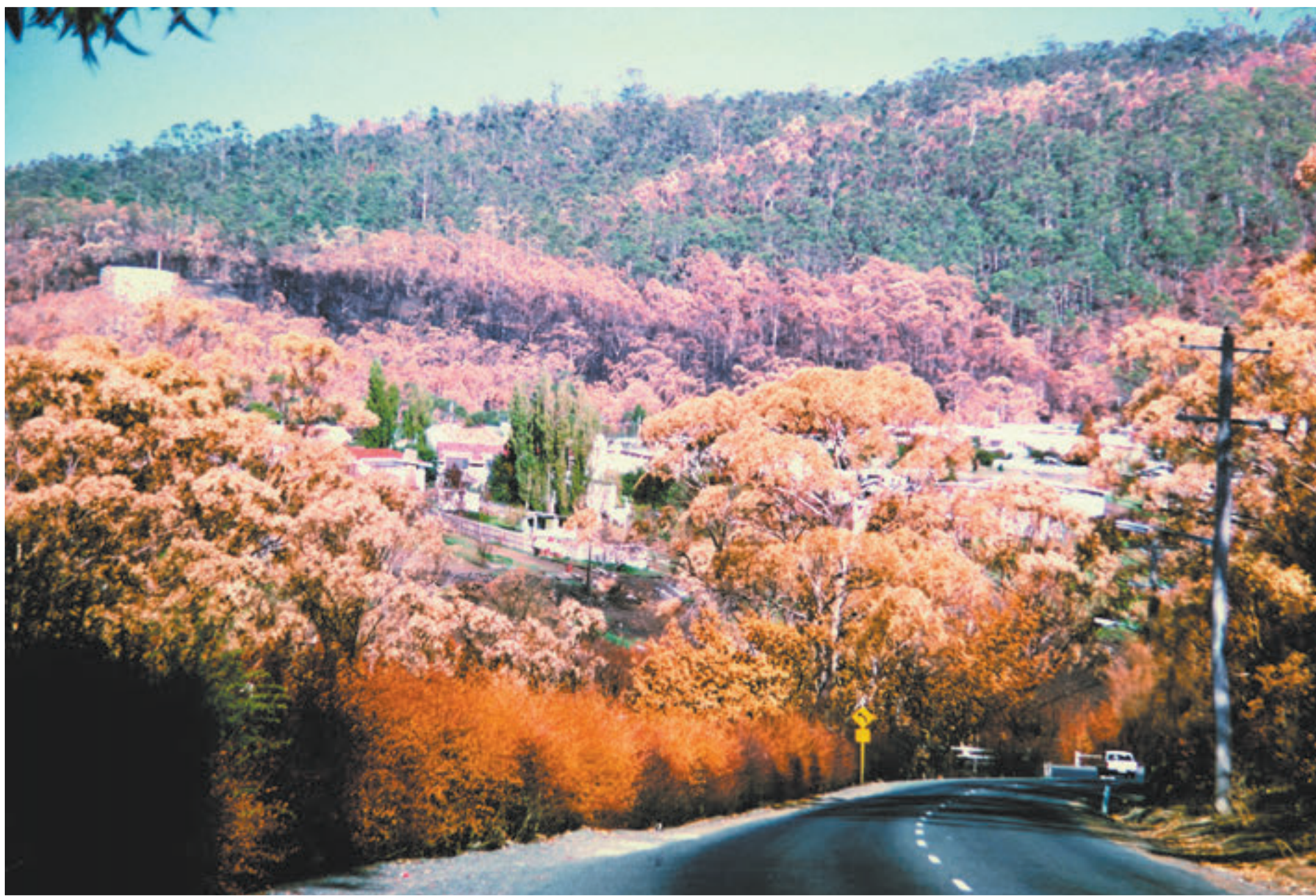
Dead and dying trees surrounded Tarooma for a long time after Black Tuesday.