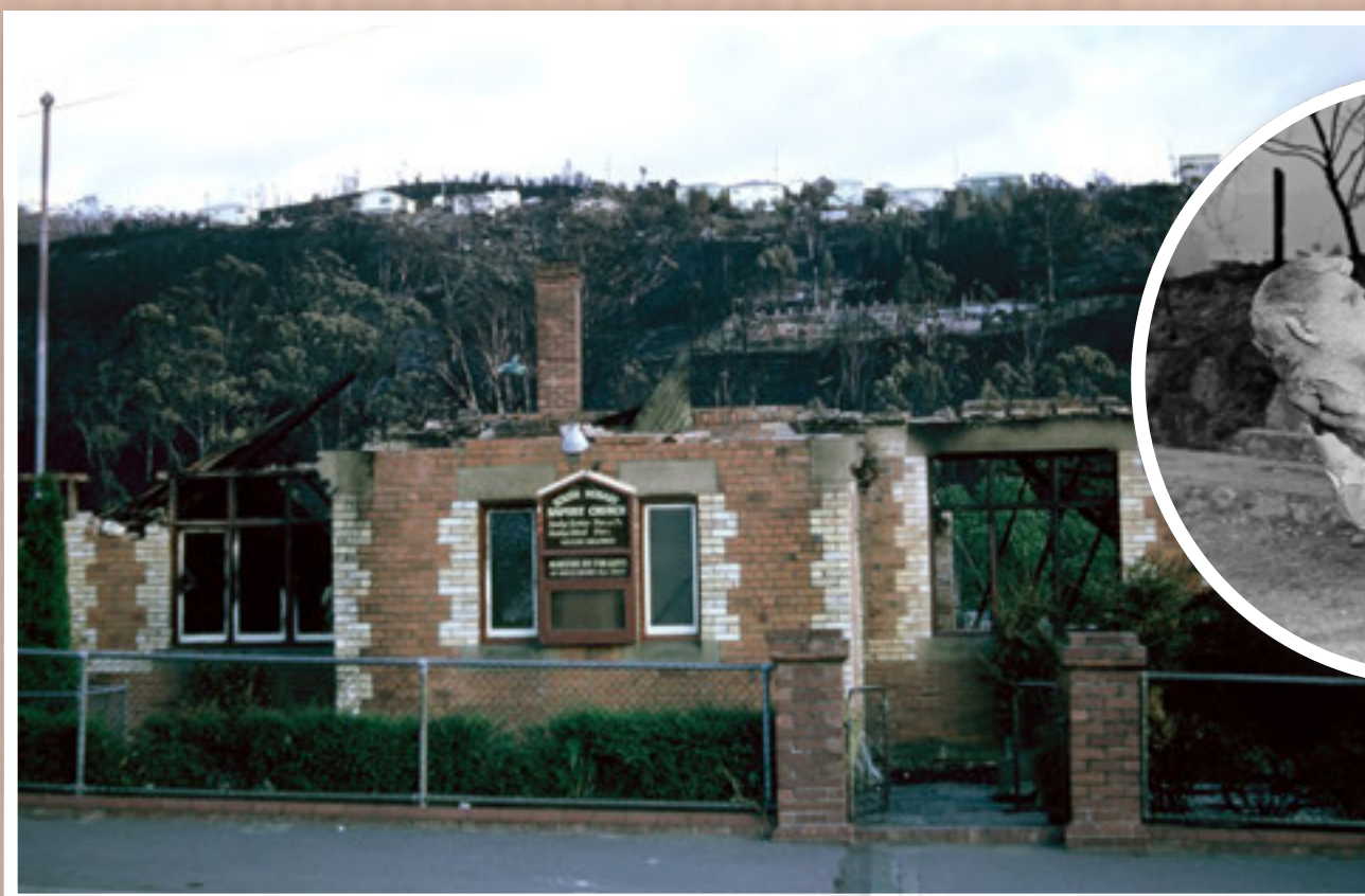
The Baptist Church was among the extensive losses at South Hobart.