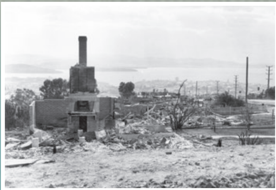
The scene in Forest Rd provided a stark reminder of the destruction for months to come.