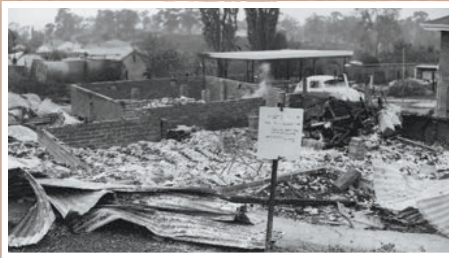
A notice posted in front of the destroyed medical centre gave details of a temporary location for future medical clinics.