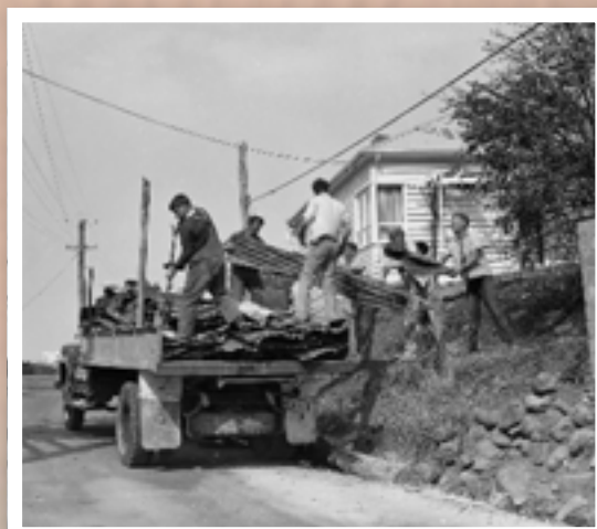
A band of workers cleaning up a home in Waterworks Rd, which was one of the badly-hit districts.