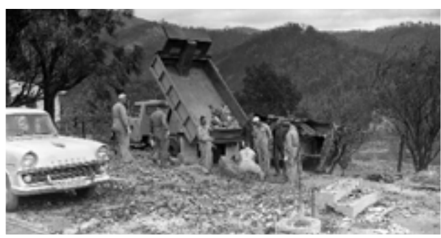
Left and right: Members of the Waterside Workers Federation helped to clear the sites of fire-gutted houses in South Hobart.