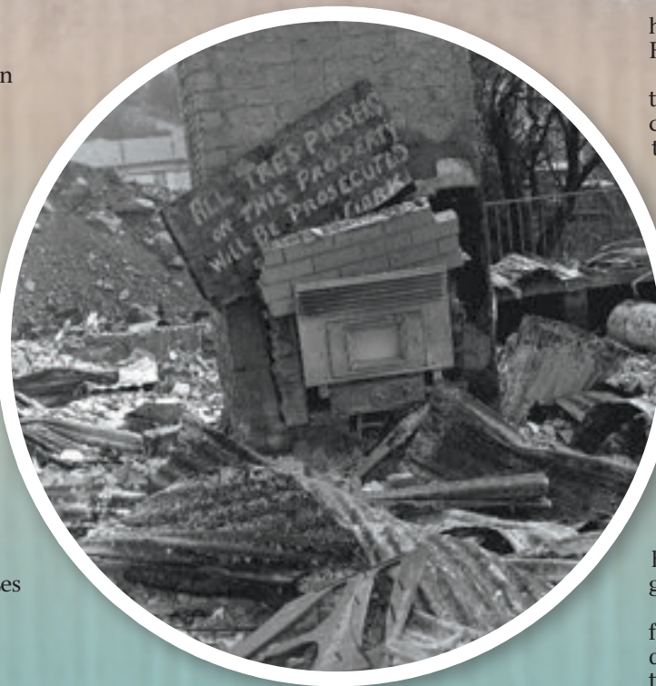
A devastated householder's warning to looters.

Local residents were seen racing everywhere in an attempt to put out the fires. Many houses were saved, but the overall scene was disaster, with 52 houses being