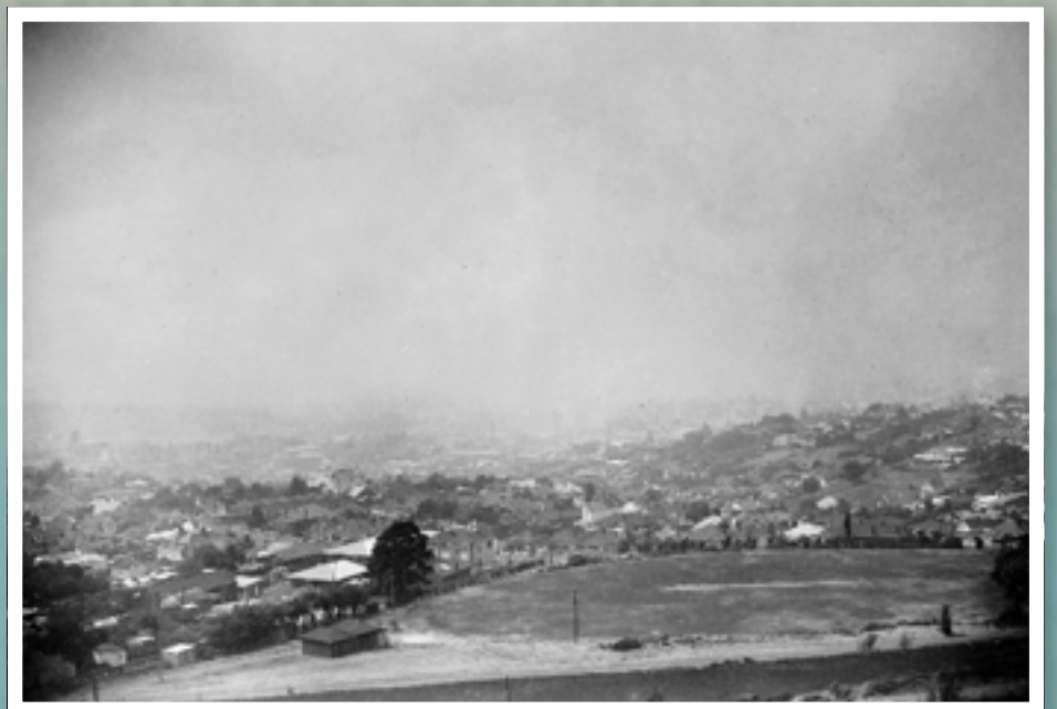
A pall of smoke hung over central Hobart at the height of the blaze.