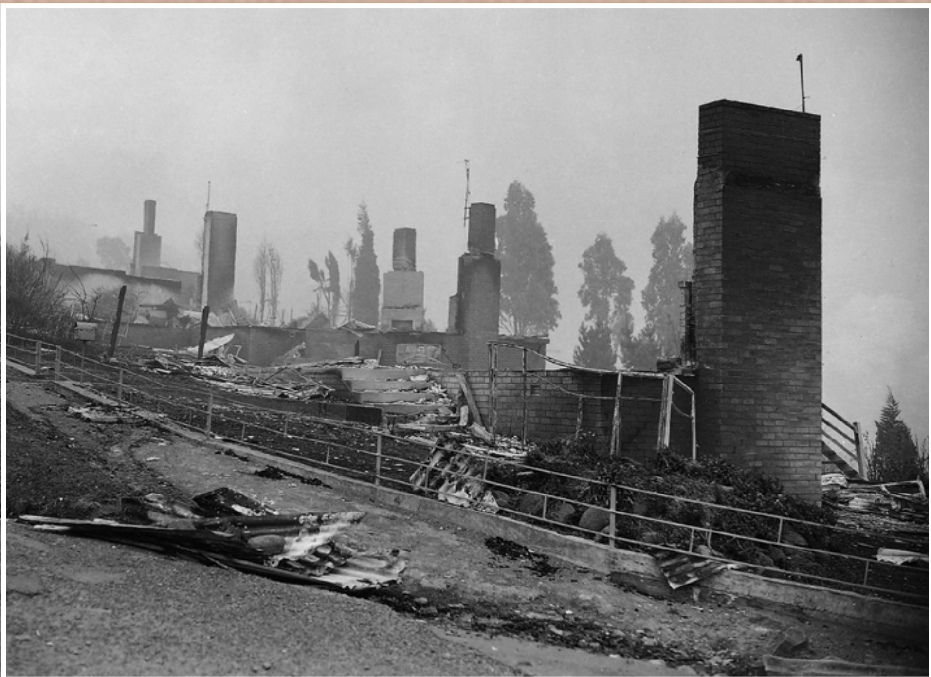
Witnesses said fire went through these Forest Rd homes "like a saw", razing 16 houses in the West Hobart street.

burning, despite efforts to save it. Houses were also ablaze in Wentworth St.