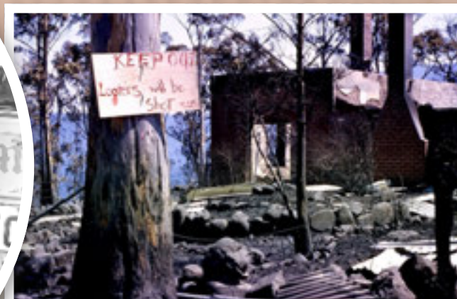
Left: Les Eaton lost his petrol station business at Longley on Black Tuesday but was back in action nine days later, filling up the Mercury's Mini from one of two new bowsers. Above: A warning to looters on Summerleas Rd.