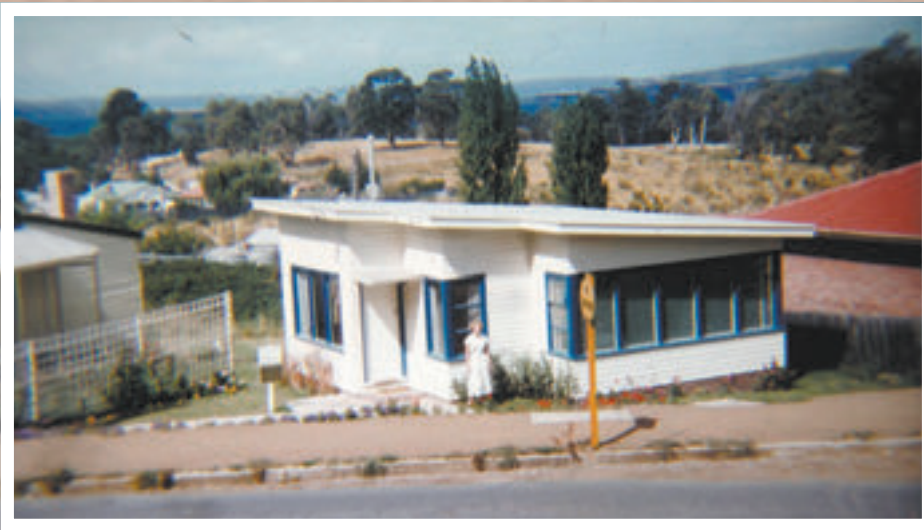
The weatherboard doctors' surgery at Tarooma burned down after fire spread from an old building next door.