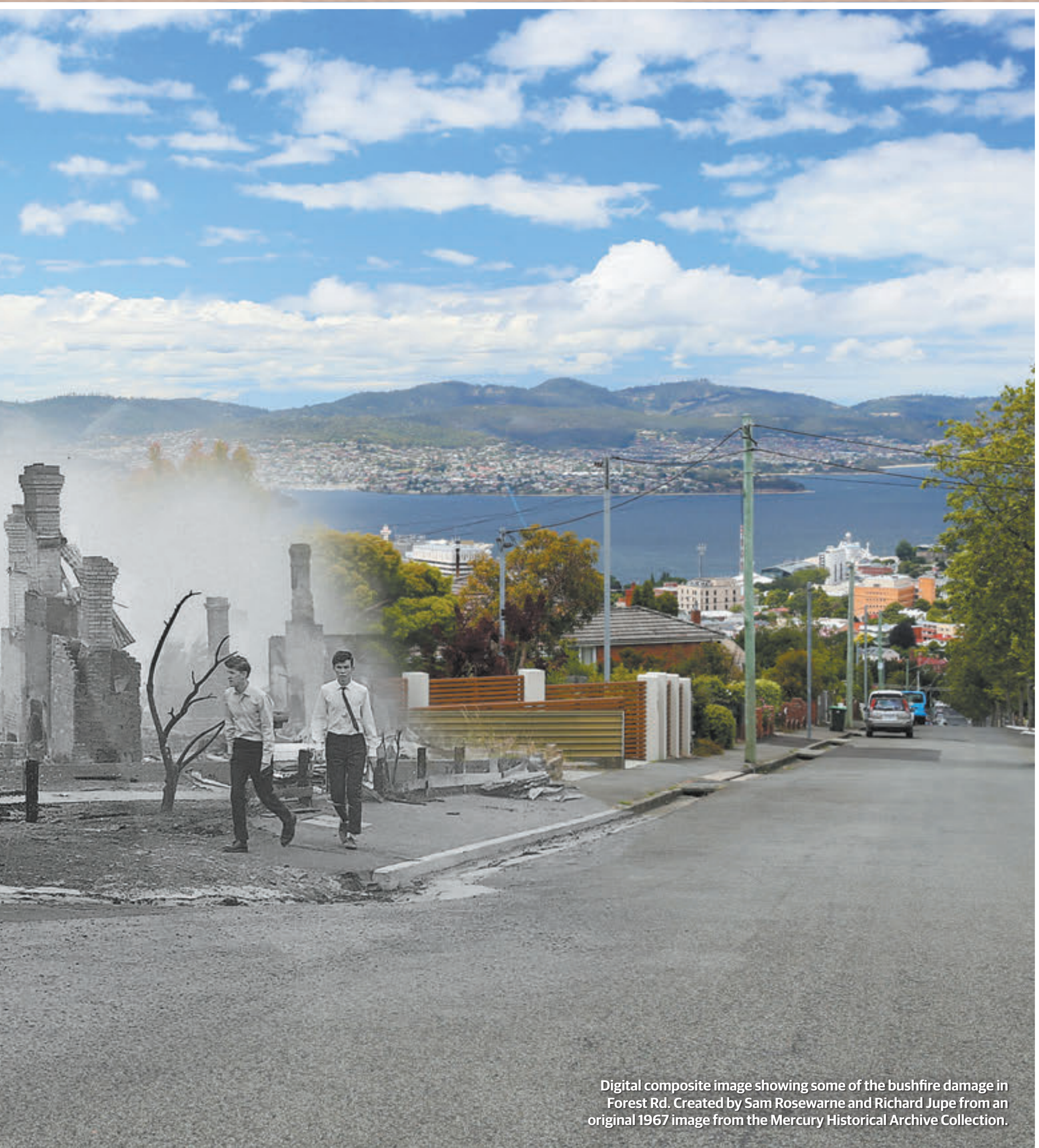
Digital composite image showing some of the bushfire damage in Forest Rd.