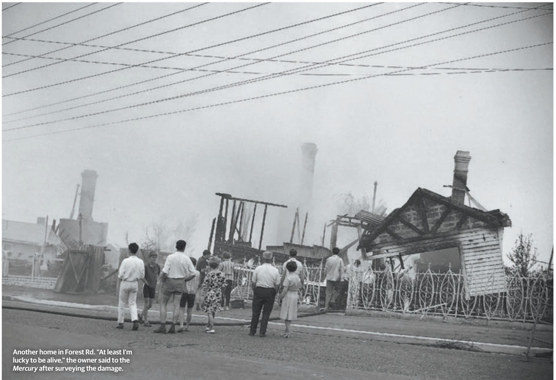
Another home in Forest Rd. "At least I'm lucky to be alive," the owner said to the Mercury after surveying the damage.