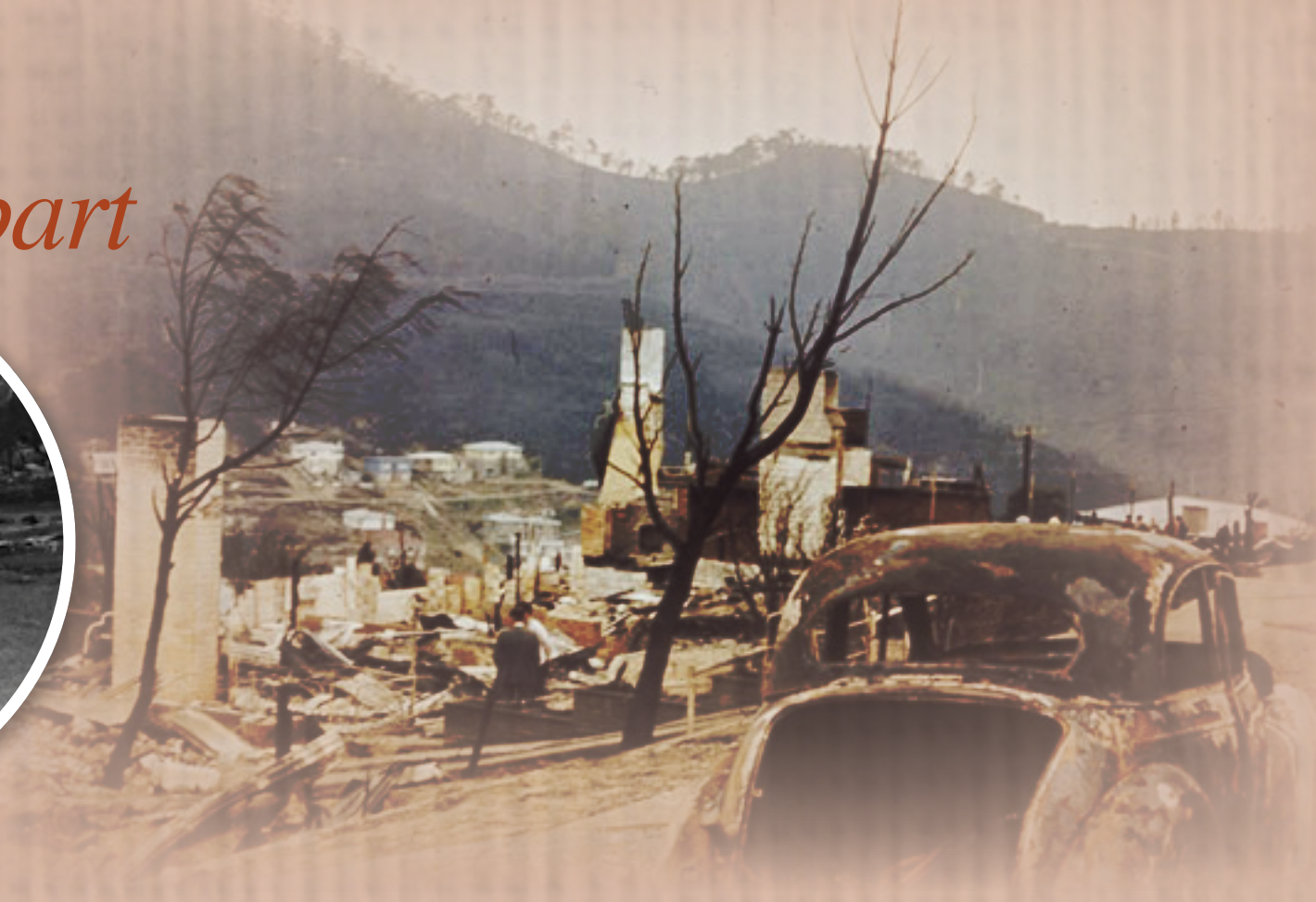
Dozens of homes at South Hobart were left in ruins.