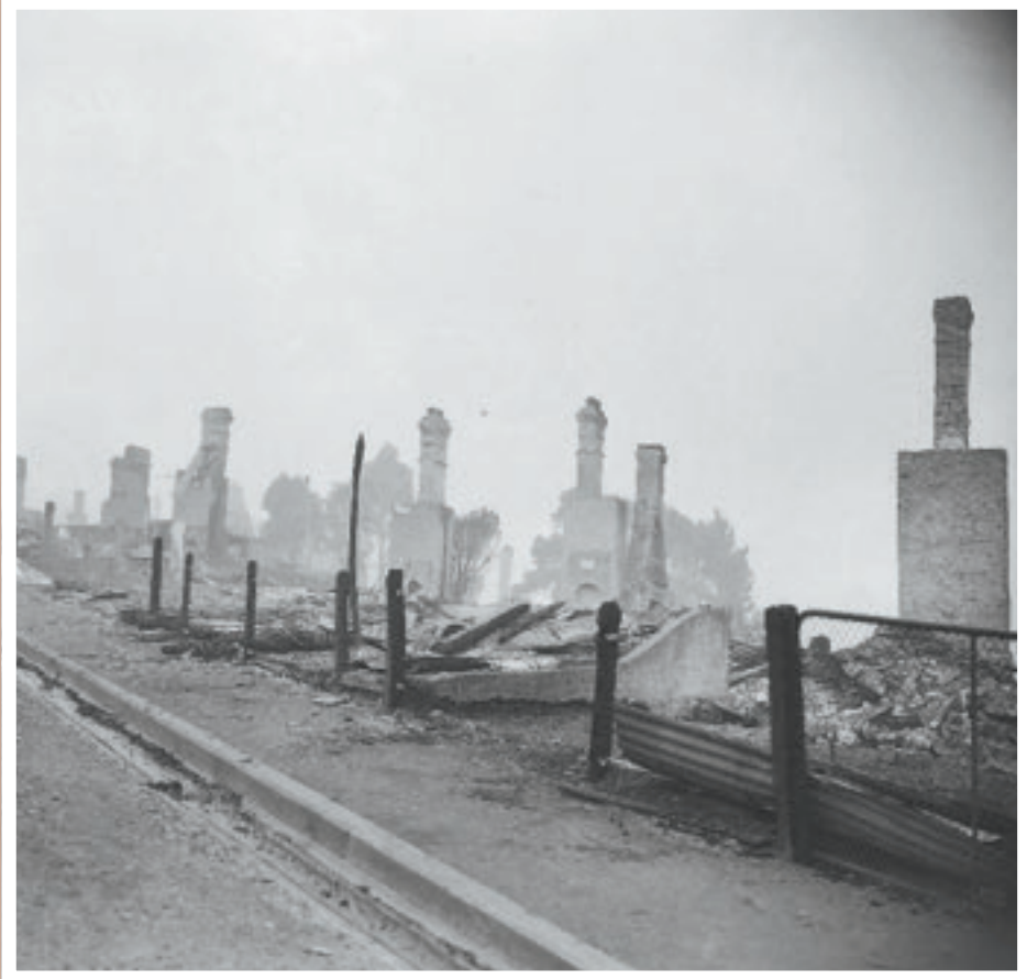
Forest Rd in West Hobart came to represent the destruction that was visited upon the capital city.