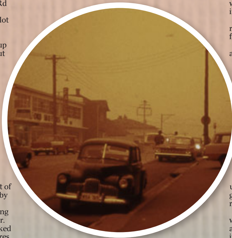
The smoky haze in Brisbane St, central Hobart, on February 7, 1967.

Nearer the city the fire had stopped spreading due to a lessening of the wind, although individual houses were still catching alight. The Cascade Brewery was still