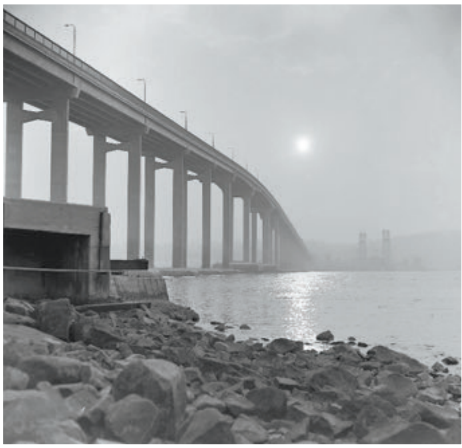
The Tasman Bridge and the remains of the original floating bridge emerging from the smoke that engulfed much of Hobart.