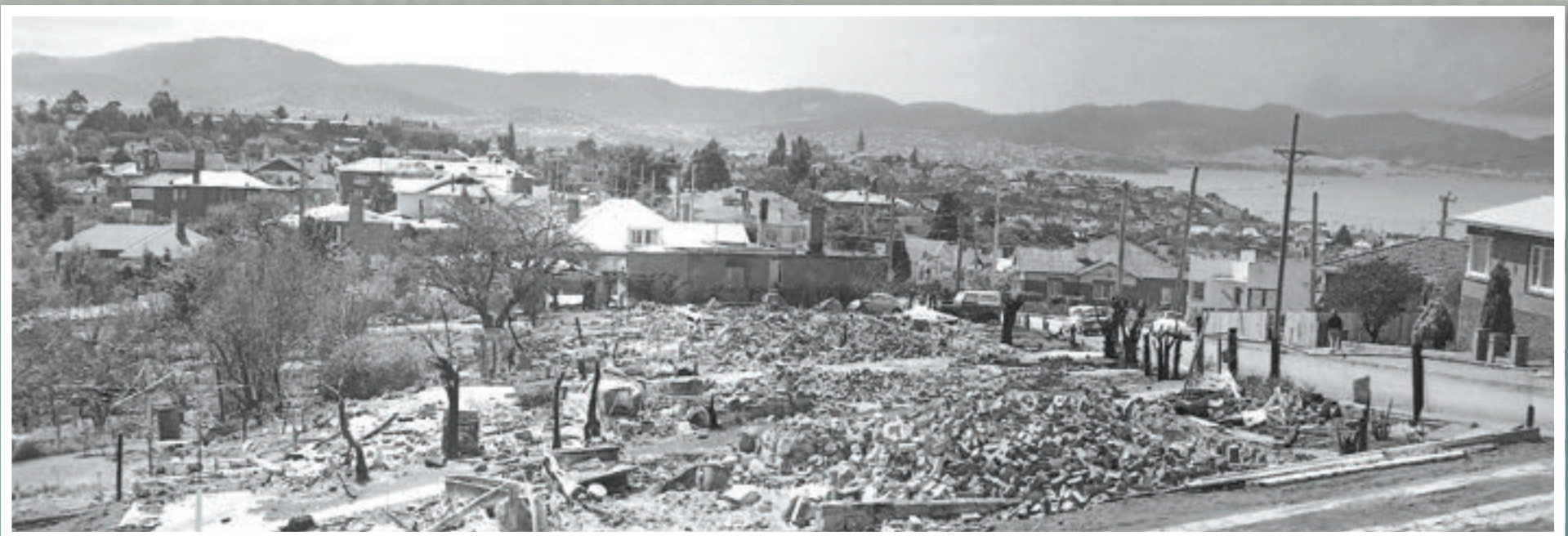
The Black Tuesday fires were perilously close to Hobart's central business district, with dozens of houses lost on suburban streets.