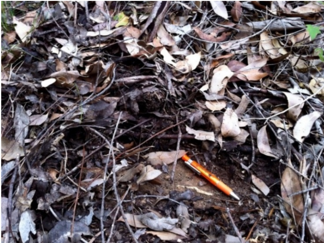
Figure 5 Karri litter bed fuel profile