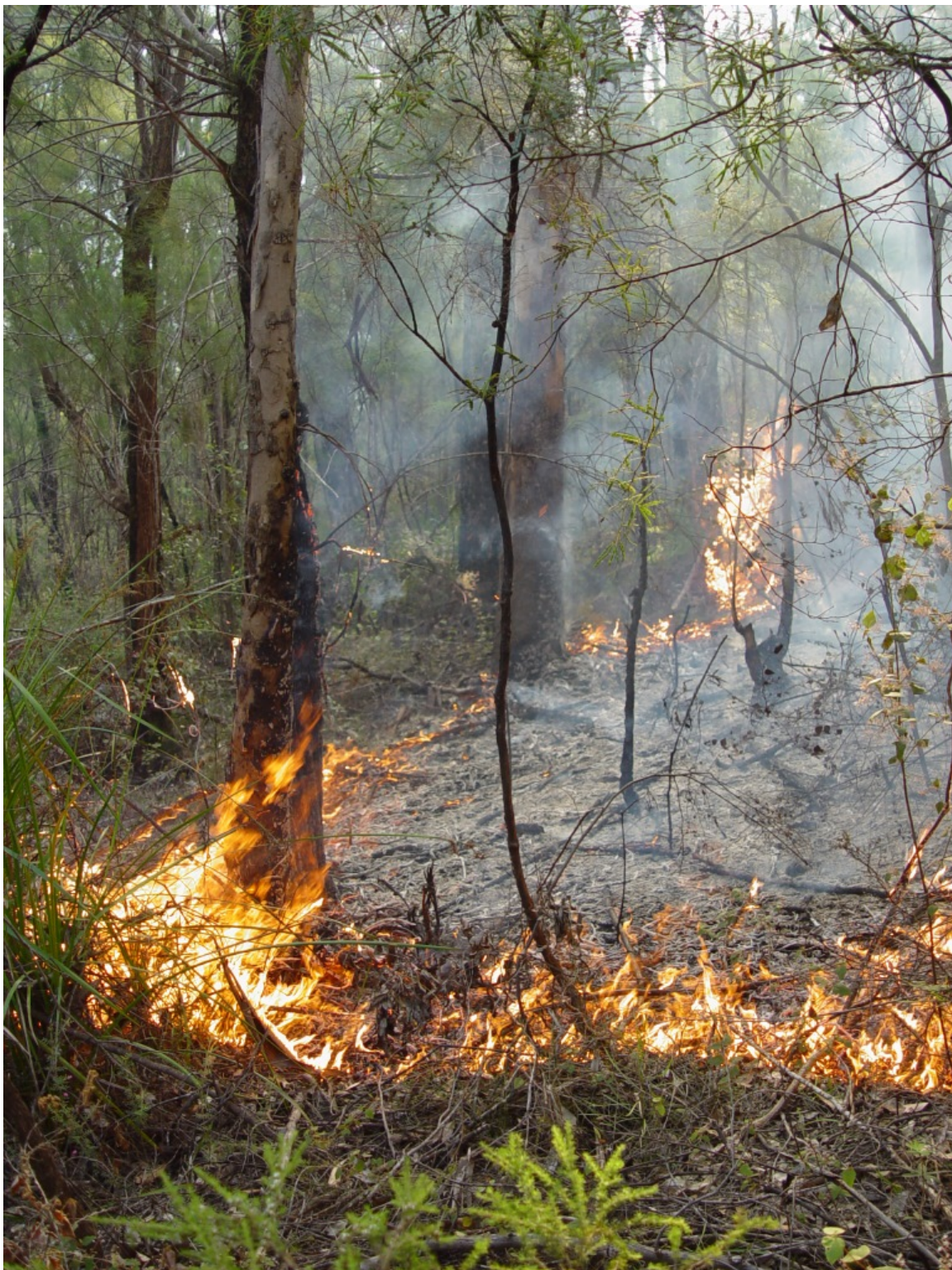
Figure 6 Low intensity backing fire in karri forest with shrub understorey

Assessment also needs to be made of likely smoke transport and settling locations to inform placement of smoke hazard signs on public roads and any other prudent smoke management actions.