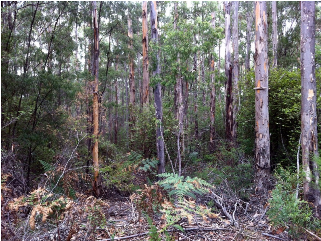
Figure 2 Fuel structure in the second year after burning in 25 year old karri regrowth forest