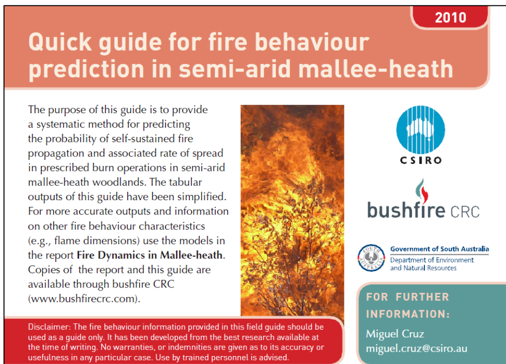
Figure 3 CSIRO mallee-heath fire behaviour prediction

Weather forecasts for the planned burn site should be obtained from the Bureau of Meteorology, relevant for the location where burning will be carried out. Upon arrival at the burn site, field weather readings should be checked for alignment with and variance with forecast conditions, and fuel moisture readings taken in surface and near-surface and suspended fuels. Dead fuel moisture content should be compared with predicted fuel moisture using the CSIRO Quick Guide for Fire Behaviour Prediction in Semi-Arid Mallee-Heath .