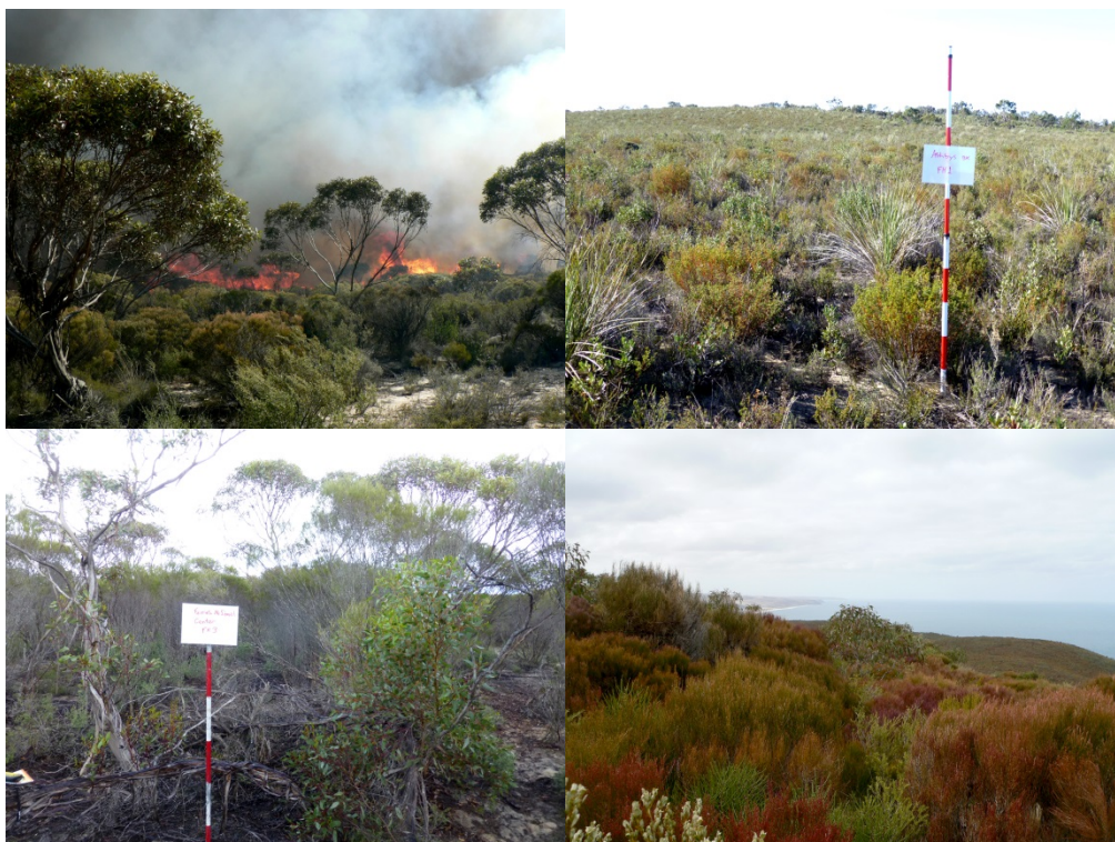
Figure 1 Mallee-heath

Mallee dominated landscapes typically have low population densities, and modest local capacity for fire suppression. The majority of mallee area burnt is by large, unplanned summer fires, burning when seasons with abundant fuel conditions, ignitions and adverse fire weather coincide. Fire suppression efforts on established fires often have little impact on the eventual fire size and impact area, other than to provide life and property protection at specific locations during the fire. Fire extent and impact are influenced to a much greater extent by the presence of low fuel areas in the landscape which restrict fire spread until the arrival of weather conditions that extinguish the fire or facilitate its containment. Low fuel areas in mallee can be created by unplanned fires, prescribed burns, or mechanical treatments. Mallee landscapes also contain 'natural' areas of low fuel, for example lake beds, chenopod shrublands and areas of bare ground.