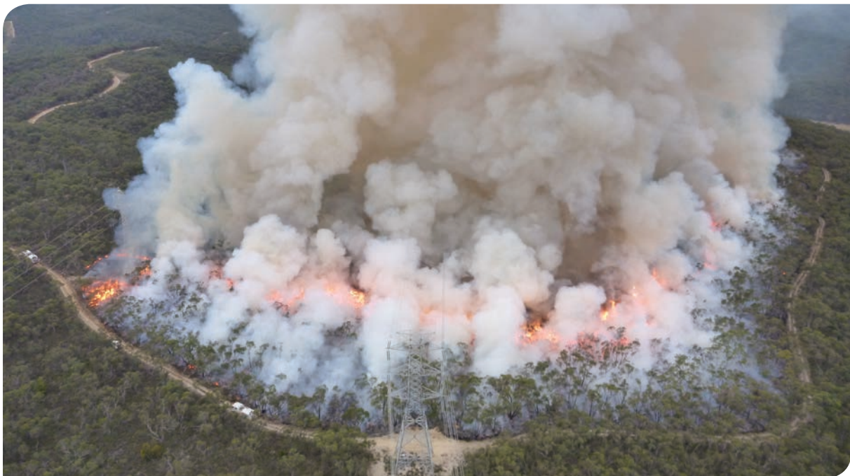
Utilising internal draw and convection currents in a planned fire in South Australia, in 2011.

A source of potential harm or a situation with potential to cause loss.