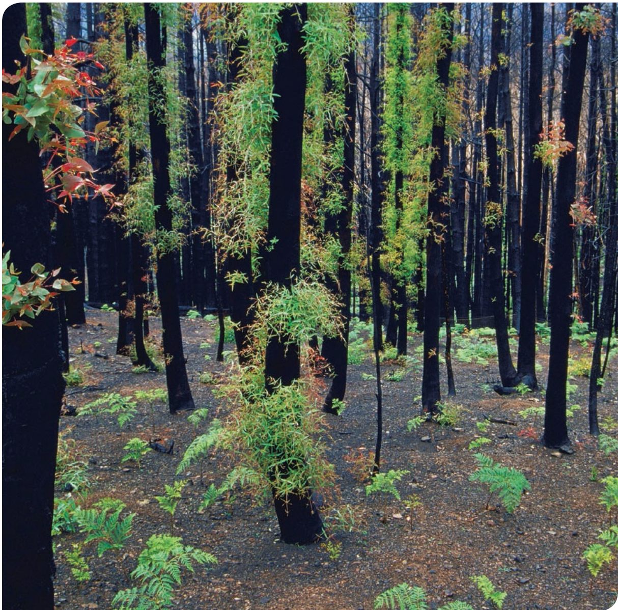
Vigorous native forest epicormic regrowth following a high intensity wild fire.

'...fire can be damaging and devastating in some circumstances, and essential for maintaining productive and healthy landscapes in others.'