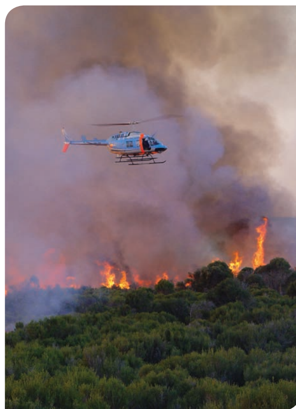
Planned fire in coastal forests using aerial incendiary operations in South Australia, 2001 (photo: Chantelle O'Brien, Department of Environment, Water and Natural Resources, South Australia).

Australia plays a significant role within the international bushfire management community. Our achievements in fire research, bushfire mitigation and management, and community involvement, are increasingly influencing approaches to bushfire management worldwide. A clear vision and policy, aimed at improving the management of fire by land and bushfire management agencies and communities, will consolidate this international contribution.