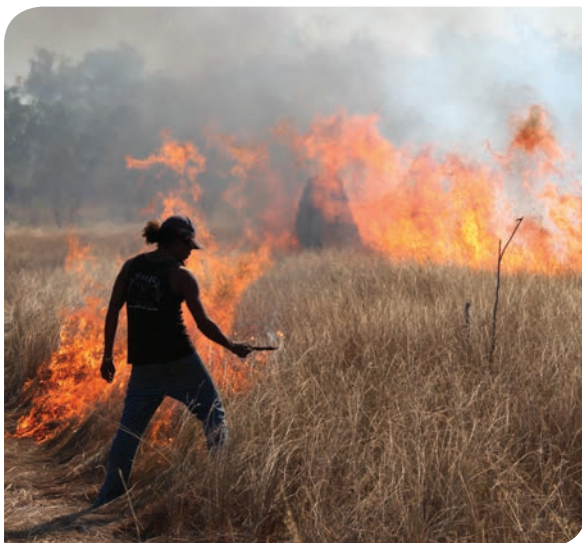
Traditional lighting of the landscape in Cape York, in July 2011 (photo: Oliver Costello, NSW Office of Environment and Heritage).

In the meantime, land and fire managers will not let the lack of a comprehensive framework for planned fire, or short-term and local risks involved in using fire, unduly constrain the use of planned fire to manage the risk of severe fire impacts.