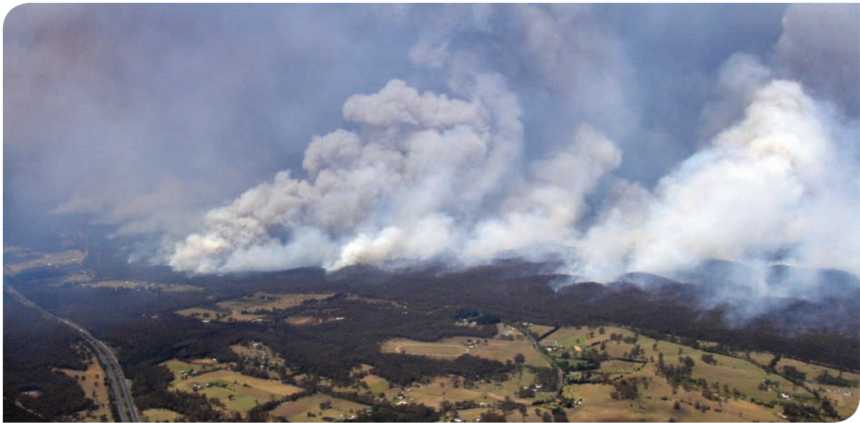
Columns of smoke from burning operations near Mittagong, NSW, during the December 2001 Black Christmas fires (photo: Stephen Wilkes, ACT Parks and Conservation Service).

In northern Australia, few years pass without large areas being burnt. Around 90 per cent of the area of Australia burnt by fire each year is found north of the Tropic of Capricorn, with burning occurring during the dry season, generally between April and November. These fires usually have a relatively low economic impact because of the low population density and the dispersed nature of built assets. Increasingly however, we are gaining a better understanding of the effect of these fires on biodiversity, greenhouse gas emissions and carbon balances. In the grazed rangelands of northern Australia, fire remains both a threat to livelihoods and a valuable tool for managing pastures, weeds and livestock and for maintaining land condition.