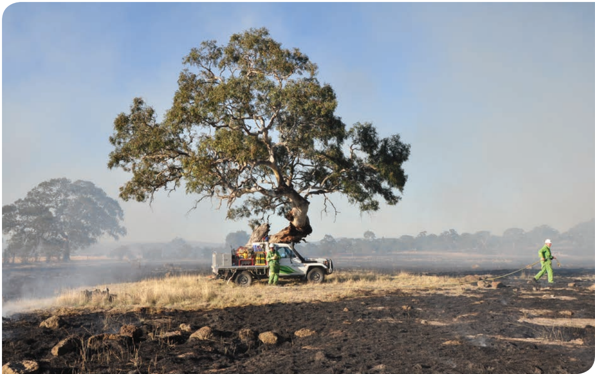
Protection of important remnant vegetation during a 2010 planned fire in Victoria.