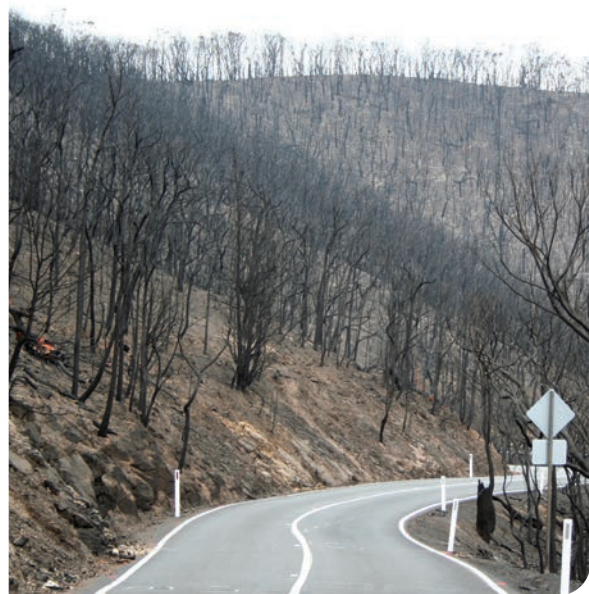
Kinglake Road, Victoria, one week after the February 2009 Black Saturday fires.

'...appropriate use of planned fire to protect communities and their assets, and to protect and conserve natural and cultural values.'