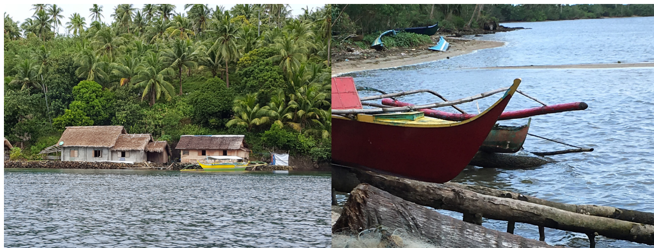
Fishing is one of the primary sources of livelihood for coastal and island communities.

Conversely, weak (or less inclusive) community engagement approaches focus on disseminating top-down information and gathering feedback on government proposals or issues through consultation via town hall meetings, surveys and committees. They tend to reflect normal business over time and lack willingness or knowledge to develop stronger approaches (Aldunce et al. 2016, Cavaye 2004, Hindmarsh 2012, Nkoana et al. 2017). Typically, they feature fragmented planning and policy processes that result in poor coordination and policy implementation. They perpetuate cultural barriers to participation involving cultural leadership, beliefs and perspectives; community marginalisation and lack of supportive resources (McMartin et al. 2018, Samaddar et al. 2015, Zafrin et al. 2014). The burgeoning international literature supports the view that strong community engagement is highly effective to address the interrelated social and environmental complexities of CCA and DRRM (e.g. Schlosberg et al. 2017, Tanwattana 2018).