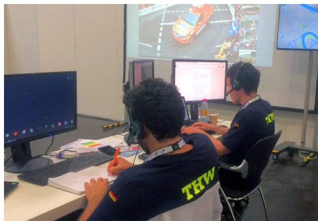
The VOST in Germany during a deployment for the Tour de France cycling race in 2017.

In recent years, the VOST concept has spread quickly, first within the United States and now to other regions including South America, Europe and Oceania (VOSG 2018). As the VOST idea has spread, a lively and international community has grown. While this growth has been accompanied by a wealth of anecdotal evidence concerning the benefit of VOSTs, little systematic research has been conducted to examine the growth and formal utility the movement presents to emergency and disaster management.