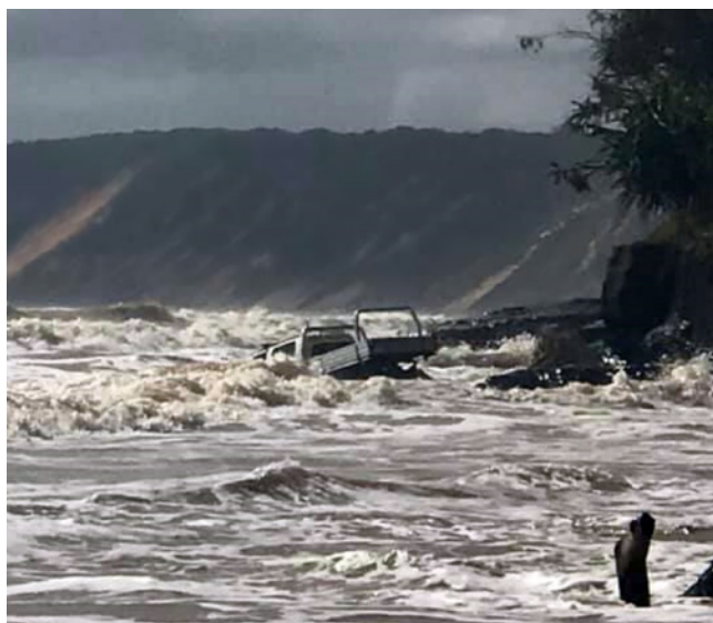
Figure 2: Wave setup resulting in beach inundation and vehicle damage at Rainbow Beach, north of the Sunshine Coast.

Source: Rainbow Beach Towing and Roadside Assist 3