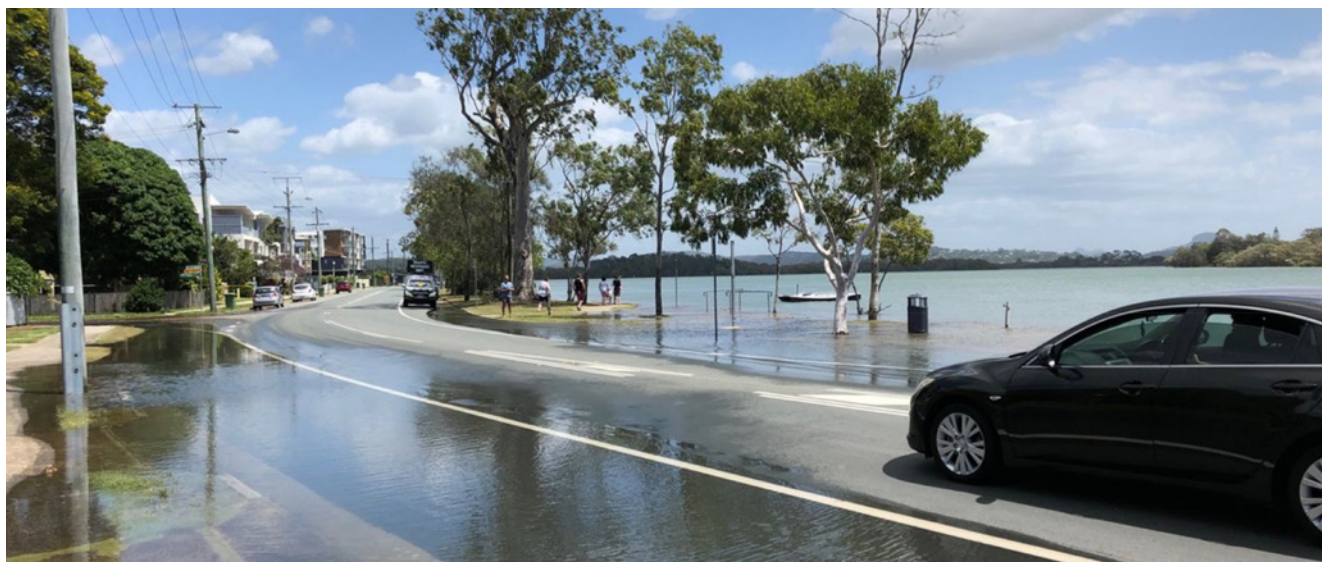
Figure 3: Minor river flooding in Maroochydore, Sunshine Coast associated with high spring tides and the storm surge component from Cyclone Oma.