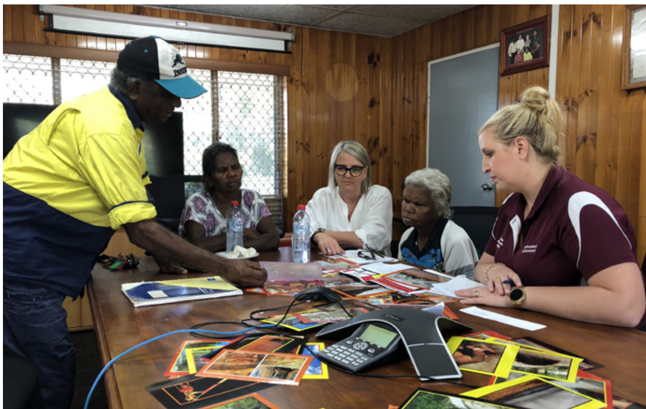
Wujal Wujal community elders worked with Queensland Reconstruction Authority staff to develop the recovery plan.