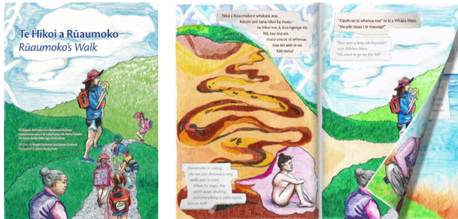
Figure 1: Te Hiko a Rūamoko tsunami education project materials.