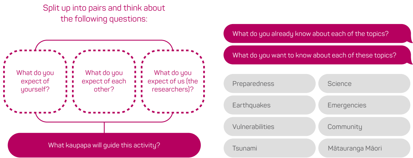
Figure 3: Pre-program exercise questions.

long and strong get gone' and what to do in the event of a tsunami was low among the ākonga. Earthquakes were mentioned frequently by ākonga, which may have been due to experience of semi-regular earthquakes of moderate size in the region (Becker et al. 2017, p.4), prolific media attention on the 2010, 2011 and 2016 earthquakes (Carter & Kenney 2018) or regular public and school-based campaigns on earthquake preparedness. Confidence of ākonga discussing mātauranga Māori and using Te Reo was also mixed with some ākonga happy to discuss pūrākau (oral histories) and speak in Te Reo, while others were more reluctant.