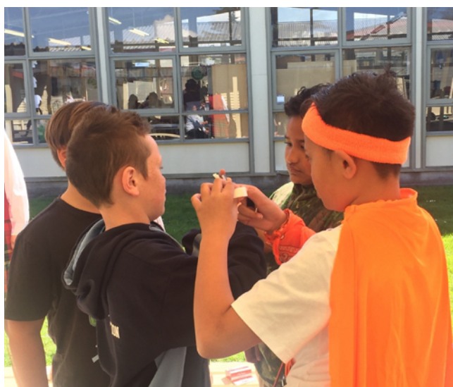
Tamariki (children) building tsunami resilient structures.