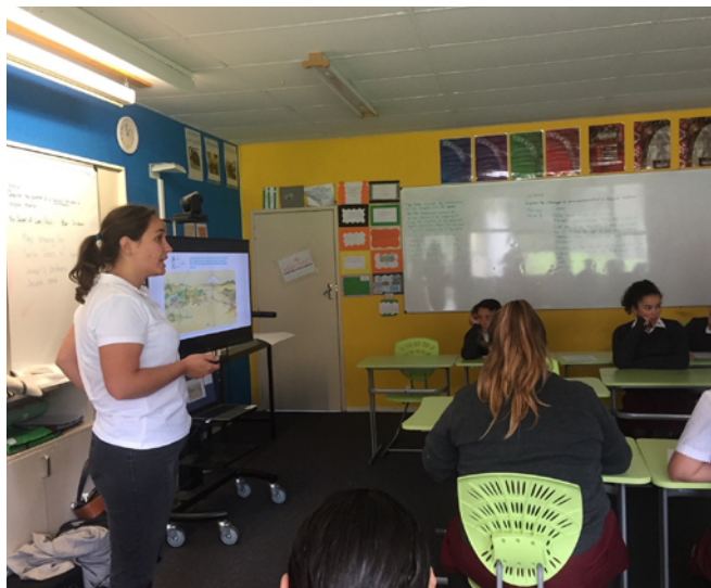
Classroom sessions were facilitated by East Coast LAB.