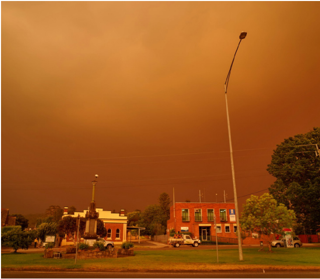
Bushfires turned skies red over the town of Bruthen in Victoria's East Gippsland. Images of Australia's 'Black Summer' were shared widely and sparked international climate concern.