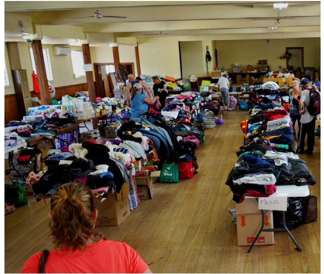
Mass evacuations and displacement of residents during the 2019–20 bushfire season triggered extensive relief and recovery responses.